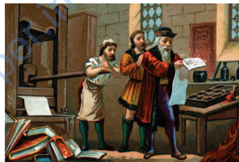
An artist's impression of Gutenberg printing the first sheet of the Bible.

Look at the collage on the left and list six various kinds of media that you see.