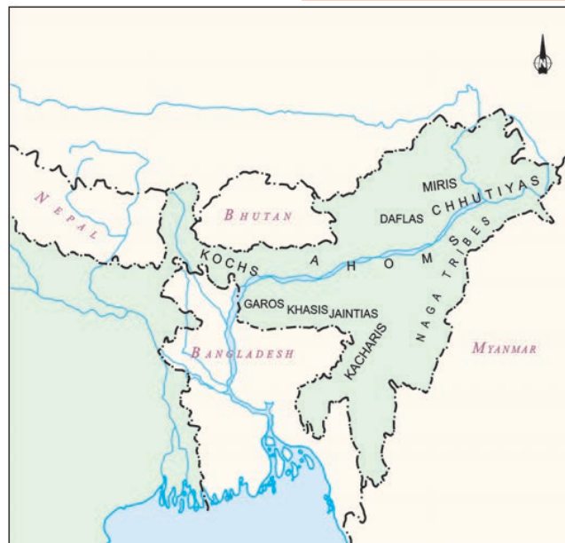
Map 3 Tribes of eastern India.

Discuss why the Mughals were interested in the land of the Gonds.