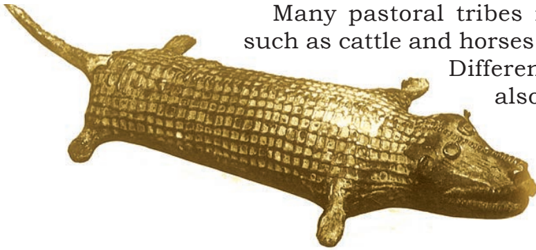
Fig. 4 Bronze crocodile, Kutiya Kond tribe, Orissa.

Many pastoral tribes reared and sold animals, such as cattle and horses, to the prosperous people. Different castes of petty pedlars also travelled from village to village. They made and sold wares such as ropes, reeds, straw matting and coarse sacks. Sometimes mendicants acted as wandering merchants. There were castes of entertainers who performed in different towns and villages for their livelihood.