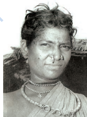
Fig. 5 A Gond woman.

The administrative system of these kingdoms was becoming centralised. The kingdom was divided into