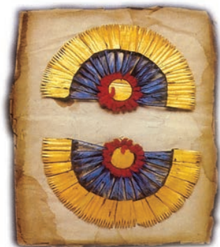
Fig. 7 Ear ornaments, Koboï Naga tribe, Manipur.