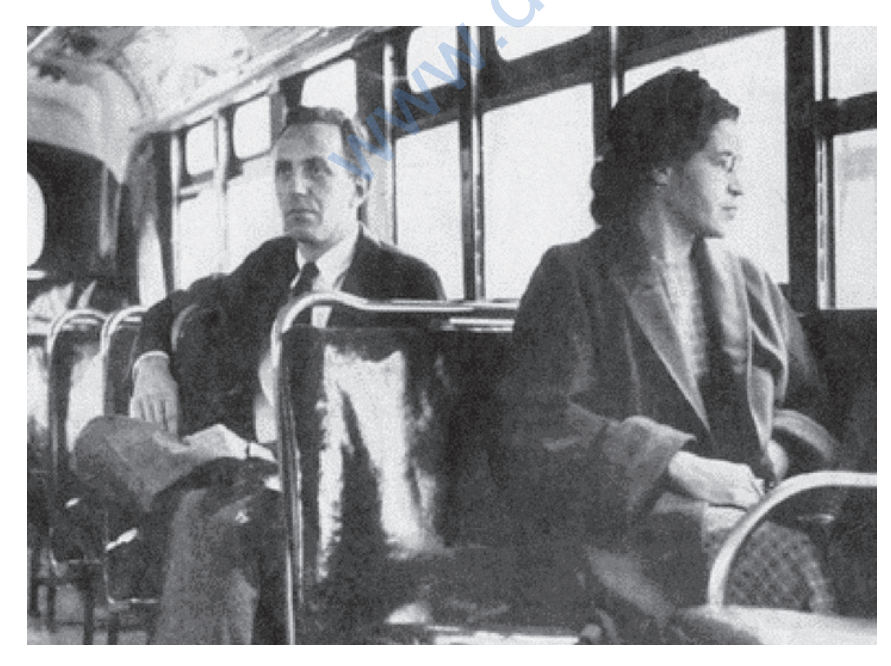
Rosa Parks, an African– American woman, changed the course of American history with one defiant act.