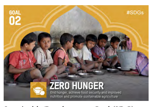
Sustainable Development Goal (SDG) www.in.undp.org

The Parliament is the cornerstone of our democracy and we are represented in it through our elected representatives.