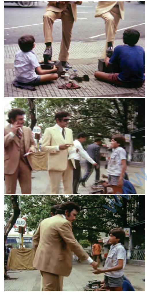
In the 1975 film, Deewar, a boy who works as a shoeshine refuses to pick up a coin thrown at him. He feels that there is dignity in the work that he does and insists that his fee be given respectfully.

Can you think of an incident in your life in which your dignity was violated? How did this make you feel?