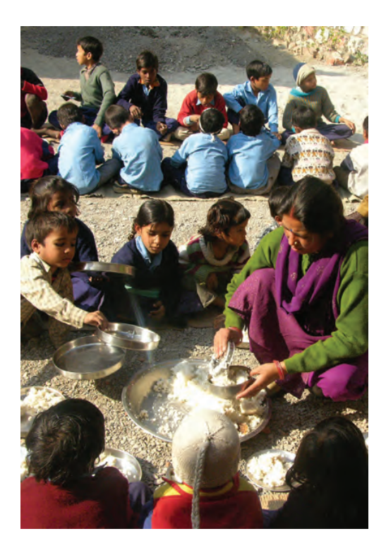
Children being served their midday meal at a government school in Uttarakhand.

What is the midday meal programme? Can you list three benefits of the programme? How do you think this programme might help promote greater equality?