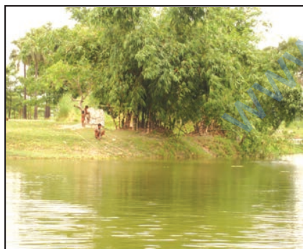
A clean lake

Binod is a fisherman living in the Matwali Maun village of Bihar. He is a happy man today. With the efforts of the fellow fishermen – Ravindar, Kishore, Rajiv and others, he cleaned the maun or the ox-bow lake to cultivate different varieties of fish. The local weed (vallineria, hydrilla) that grows in the lake is the food of the fish. The land around the lake is fertile. He sows crops such as paddy, maize and pulses in these fields. The buffalo is used to plough the land. The community is satisfied. There is enough fish catch from the river – enough fish to eat and enough fish