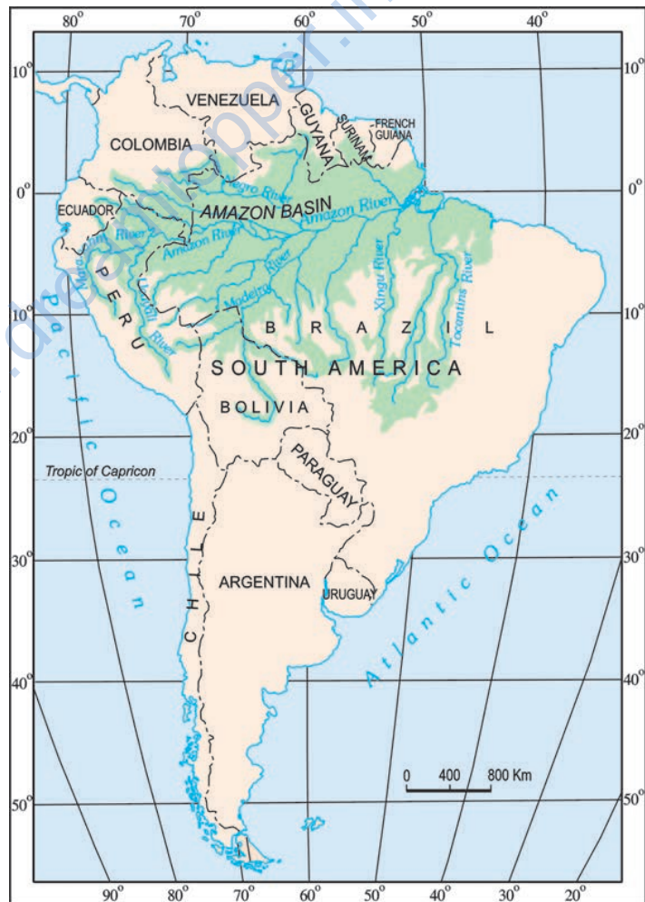
Fig. 6.2: The Amazon Basin in South America

Name the countries of the basin through which the equator passes.