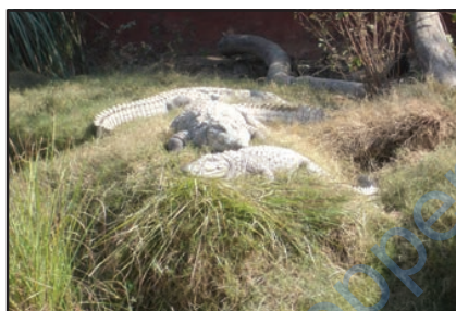
Fig. 6.12 : Crocodiles