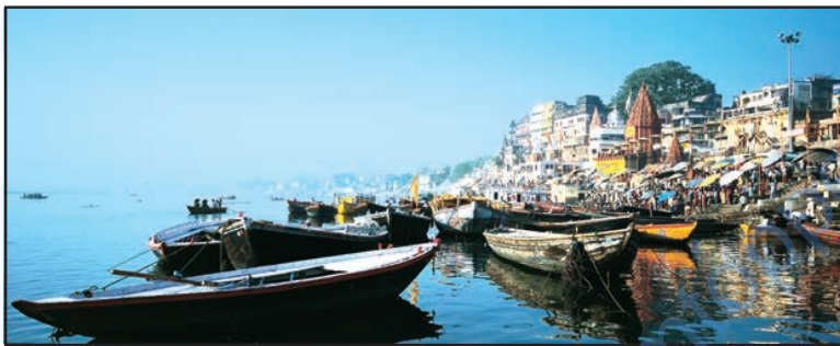
Fig. 6.13: Varanasi along the River Ganga

The Ganga-Brahmaputra plain has several big towns and cities. The cities of Allahabad, Kanpur, Varanasi, Lucknow, Patna and Kolkata all with the population of more than ten lakhs are located along the River Ganga (Fig. 6.13). The wastewater from these towns