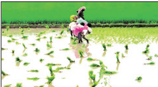
Fig. 6.9 : Paddy Cultivation

The vegetation cover of the area varies according to the type of landforms. In the Ganga and Brahmaputra plain tropical deciduous trees grow, along with teak, sal and peepal. Thick bamboo groves are common in the Brahmaputra plain. The delta area is covered with the