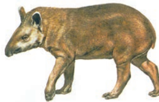
Fig. 6.5 : Tapir

The rainforest is rich in fauna. Birds such as toucans (Fig. 6.4), humming birds, macaw with their brilliantly coloured plumage, oversized bills for eating make them different from birds we commonly see in India. These birds also make loud sounds in the forests. Animals like monkeys, sloth and ant-eating tapirs are found here (Fig. 6.5). Various species of reptiles and snakes also thrive in these jungles. Crocodiles, snakes, pythons abound. Anaconda and boa constrictor are some of the species. Besides, the basin is home to thousands of species of insects. Several species of fishes including the flesh-eating Piranha fish is also found in the river. This basin is thus extraordinarily rich in the variety of life found there.