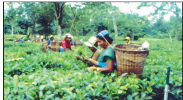
Fig. 6.10 : Tea Garden in Assam