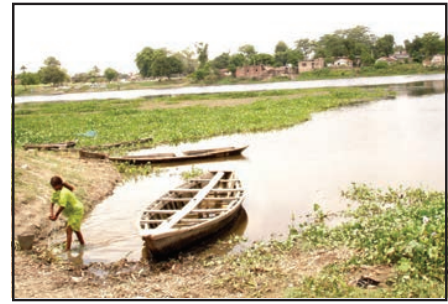
A Polluted Lake

to sell in the market. They have even begun supply to the neighbouring town. The community is living in harmony with nature. As long as the pollutants from nearby towns do not find their way into the lake waters, the fish cultivation will not face any threat.