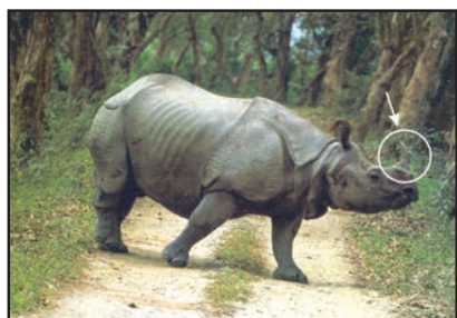
Fig. 6.11 : One horned rhinoceros

There is a variety of wildlife in the basin. Elephants, tigers, deer and monkeys are common. The one-horned rhinoceros is found in the Brahmaputra plain. In the delta area, Bengal tiger and crocodiles are found. Aquatic life abounds in the fresh river waters, the lakes and the Bay of Bengal Sea. The most popular varieties of the fish are the rohu, catla and hilsa. Fish and rice is the staple diet of the people living in the area.