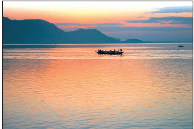
Fig. 6.7 Brahmaputra river

The tributaries of rivers Ganga and Brahmaputra together form the Ganga-Brahmaputra basin in the Indian subcontinent (Fig. 6.8). The basin lies in the sub-tropical region that is situated between 10°N to 30°N latitudes. The tributaries of the River Ganga like the Ghaghra, the Son, the Chambal, the Gandak, the Kosi and the tributaries of Brahmaputra drain it. Look at the atlas and find names of some tributaries of the River Brahmaputra.