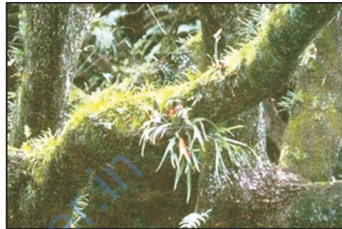
Fig. 6.3 : The Amazon Forest

As it rains heavily in this region, thick forests grow (Fig. 6.3). The forests are in fact so thick that the dense “roof” created by leaves and branches does not allow the sunlight to reach the ground. The ground remains dark and damp. Only shade tolerant vegetation may grow here. Orchids, bromeliads grow as plant parasites.