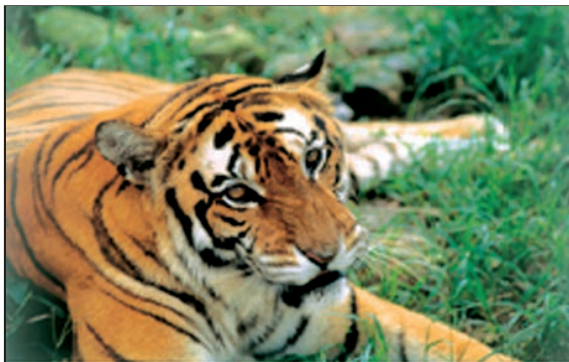
Fig. 6.14: Tiger in Manas Wildlife sanctuary

All the four ways of transport are well developed in the Ganga-Brahmaputra basin. In the plain areas the roadways and railways transport the people from one place to another. The waterways, is an effective means of transport particularly along the rivers. Kolkata is an important port on the River Hooghly. The plain area also has a large number of airports.