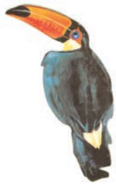
Fig. 6.4 : Toucans

The rainforest is rich in fauna. Birds such as toucans (Fig. 6.4), humming birds, macaw with their brilliantly coloured plumage, oversized bills for eating make them different from birds we commonly see in India. These birds also make loud sounds in the forests. Animals like monkeys, sloth and ant-eating tapirs are found here (Fig. 6.5). Various species of reptiles and snakes also thrive in these jungles. Crocodiles, snakes, pythons abound. Anaconda and boa constrictor are some of the species. Besides, the basin is home to thousands of species of insects. Several species of fishes including the flesh-eating Piranha fish is also found in the river. This basin is thus extraordinarily rich in the variety of life found there.