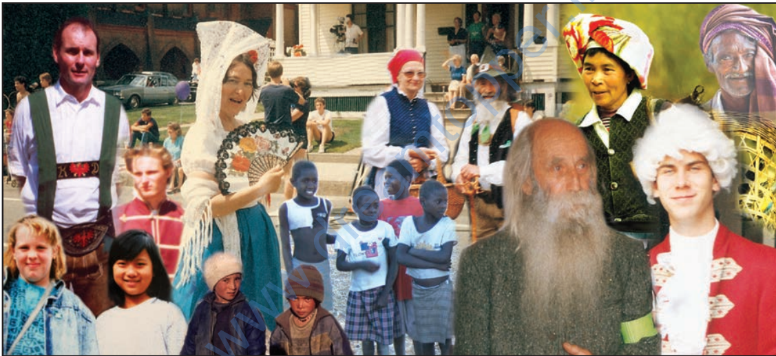
Fig. 6.1: People from various parts of the world

Renuka was excited. Shrikant Uncle was home after a gap of nearly four months. He was a wildlife photographer and travelled widely. Renuka's interest in wildlife and forests began at an early age, when her uncle introduced her to books on nature. Pictures of distant lands and people, who lived there, always fascinated her.