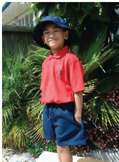
A Class VII Samoan child in his school uniform.

From Class VI onwards, boys and girls went to separate schools. The girls' school was designed very differently from the boys' school. They had a central courtyard where they played in total seclusion and