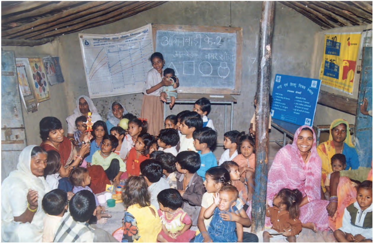
Children at an Anganwadi centre in a village in Madhya Pradesh.

This naturally has an impact on whether girls can attend school. It determines whether women can work outside the house and what kind of jobs and careers they can have. The government has set up anganwadis or child-care centres in several villages in the country. The government has passed laws that make it mandatory for organisations that have more than 30 women employees to provide crèche facilities. The provision of crèches helps many women to take up employment outside the home. It also makes it possible for more girls to attend schools.