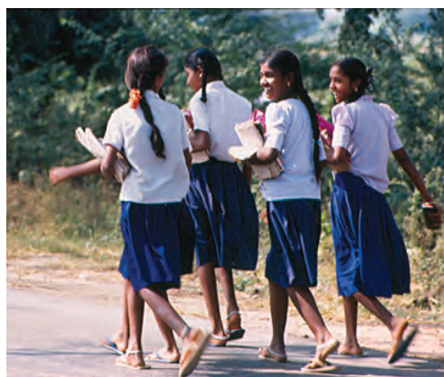
Why do girls like to go to school together in groups?

In what ways do the experiences of Samoan children and teenagers differ from your own experiences of growing up? Is there anything in this experience that you wish was part of your growing up?