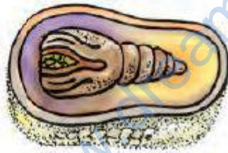
(f) Cocoon with developing moth