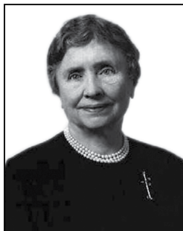
Helen A. Keller