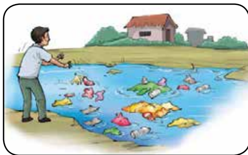
A. Throwing garbage in a water body