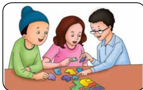
F. Working in a group

Discuss your comments/ideas in your class.