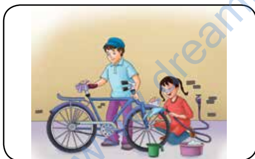
C. Washing bicycle with running water