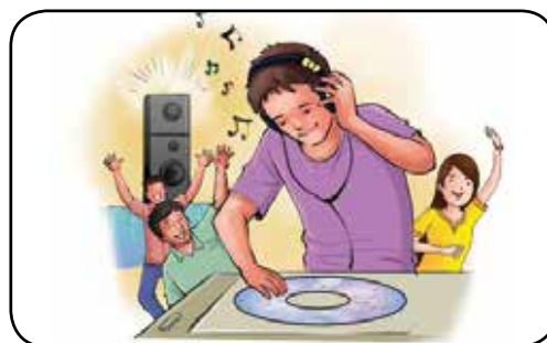
D. Loud music in a party