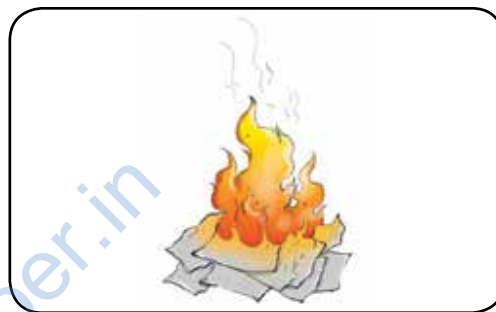
B. Burning waste paper