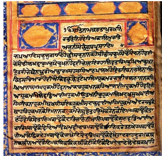
Fig. 11 An early manuscript of the Guru Granth Sahib.

a new script known as Gurmukhi. The three successors of Guru Angad also wrote under the name of “Nanak” and all of their compositions were compiled by Guru Arjan in 1604. To this compilation were added the writings of other figures like Shaikh Farid, Sant Kabir, Bhagat Namdev and Guru Tegh Bahadur. In 1706, this compilation was authenticated by Guru Tegh Bahadur’s son and successor, Guru Gobind Singh. It is now known as Guru Granth Sahib , the holy scripture of the Sikhs.