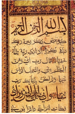
Fig. 5 A page from a manuscript of the Quran, Deccan, late fifteenth century.

A large number of Sufis from Central Asia settled in Hindustan from the eleventh century onwards. This process was strengthened with the establishment of the Delhi Sultanate (Chapter 3), when several major Sufi centres developed all over the subcontinent. The Chishti silsila was among the most influential orders. It had a long line of teachers like Khwaja Muinuddin Chishti of Ajmer, Qutbuddin Bakhtiar Kaki of Delhi, Baba Farid of Punjab, Khwaja Nizamuddin Auliya of Delhi and Bandanawaz Gisudaraz of Gulbarga.