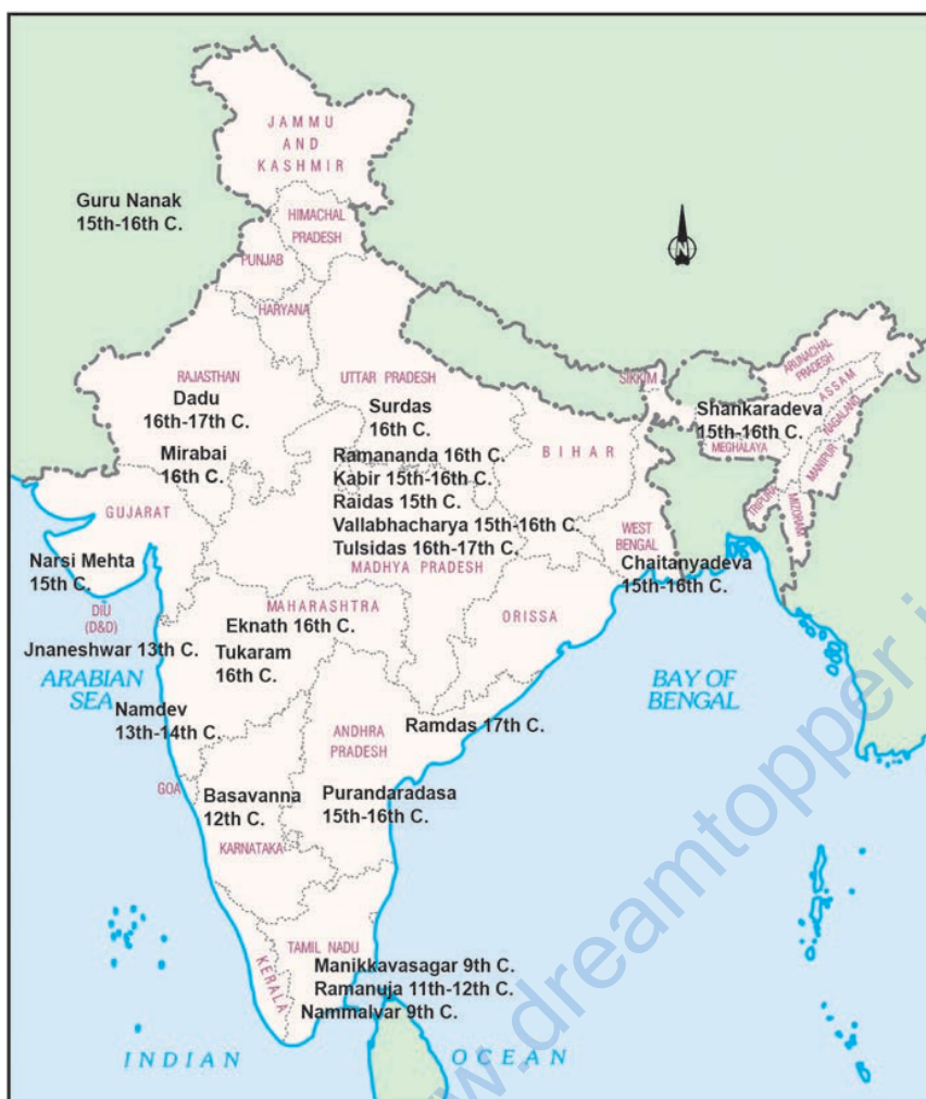
Map 1 Major bhakti saints and the regions associated with them.

The essence of Shankaradeva's devotion came to be known as Eka Sarana Nama Dharma (supreme surrender to the One). The teachings of Shankaradeva were based on the Bhagavad Gita and Bhagavata Purana. He also encouraged the establishment of satra or monasteries for transmission of knowledge. His major compositions included Kirtana-ghosha.