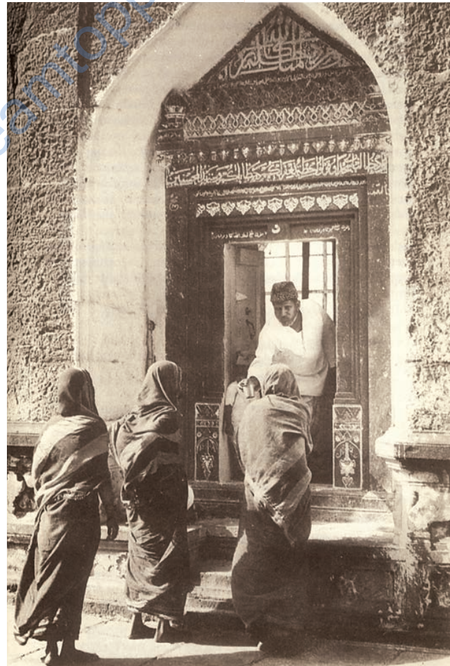
Fig. 6 Devotees of all backgrounds visit Sufi shrines.

Often people attributed Sufi masters with miraculous powers that could relieve others of their illnesses and troubles. The tomb or dargah of a Sufi saint became a place of pilgrimage to which thousands of people of all faiths thronged.