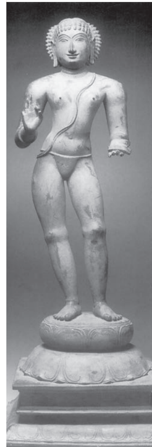
Fig. 2 A bronze image of Manikkavasagar.