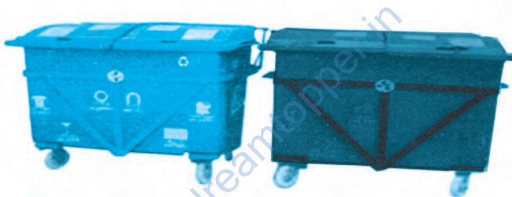
Fig. 10.4 : Blue and Green Bins

In the cities we find these bins in some places, where people can dispose of biodegradable and non-biodegradable garbage separately. Where do you think we should dispose of hazardous waste? Should there be a separate bin for it? Why?