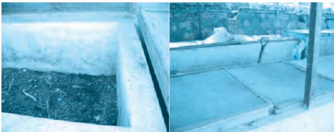
Fig. 10.5 Compost Pit prepared by Bethany Society, Shillong, Meghalaya

Often you may have come across persons (the Kabariwalas ) who visit our home, and to whom we sell old newspapers, magazines, bottles, tins, etc. Maybe, you have never thought where these products go, and what happens to them. These products are utilised as raw materials for manufacturing other products. In other words, these products are recycled . This is actually an important effort, as in this process, we not only reduce the load of garbage, but also conserve natural resources. Some of the common items that can be recycled are