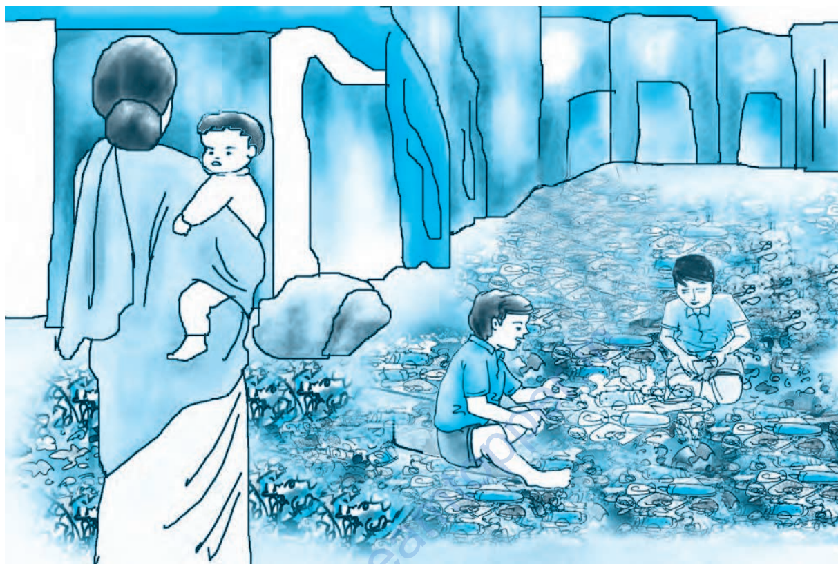
Fig. 10.3 : Children playing with waste material

Through this activity you will be surprised to find that many of the items that have been discarded by you, still have utility. On the other hand, there are certain wastes, such as wet waste (kitchen waste), which can be reduced to almost 'zero waste'. Let us now discuss how we can reduce the volume of solid waste and garbage, by practising waste management and segregation through the principles of "reuse, recycle, reduce and refuse."