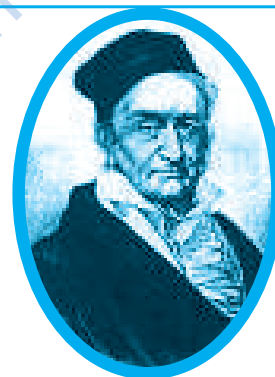
Carl Friedrich Gauss (1777 – 1855)

Carl Friedrich Gauss is often referred to as the 'Prince of Mathematicians' and is considered one of the three greatest mathematicians of all time, along with Archimedes and Newton. He has made fundamental contributions to both mathematics and science.