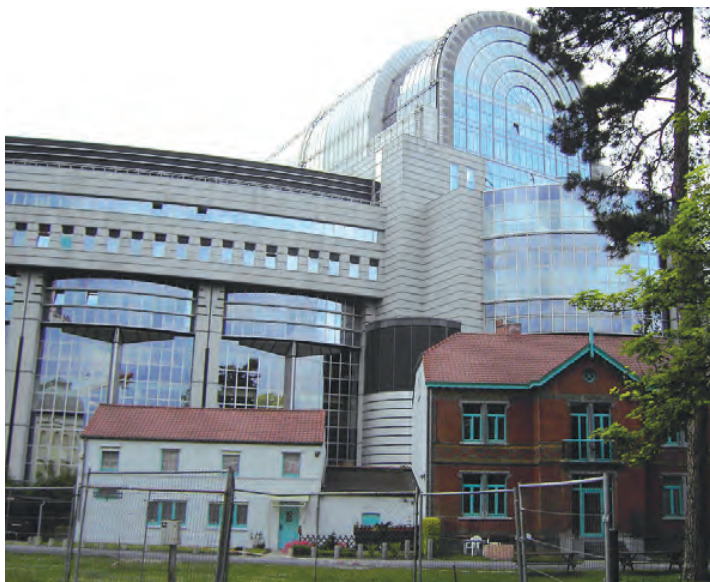
European Parliament in Brussels, Belgium

You might find the Belgian model very complicated. It indeed is very complicated, even for people living in Belgium. But these arrangements have worked well so far. They helped to avoid civic strife between the two major communities and a possible division of the country on linguistic lines. When many countries of