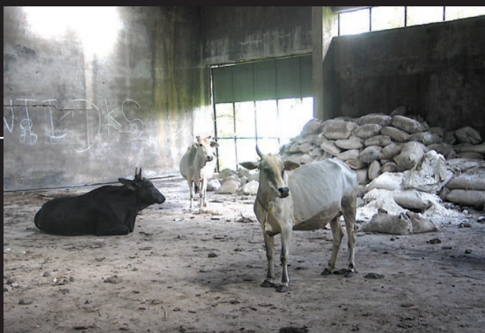
Bags of chemicals lie strewn around the UC plant

UC stopped its operations, but left behind tons of toxic chemicals. These have seeped into the ground, contaminating water. Dow Chemical, the company who now owns the plant, refuses to take responsibility for clean up.