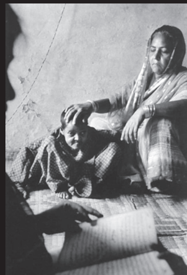
A child severely affected by the gas

Within three days, more than 8,000 people were dead. Hundreds of thousands were maimed.