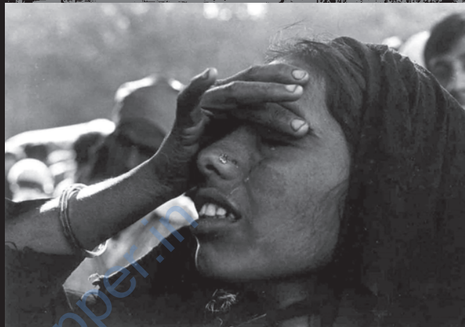
The next morning