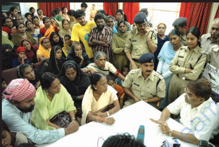
Gas victims with the Gas Relief Minister

Despite the overwhelming evidence pointing to UC as responsible for the disaster, it refused to accept responsibility.