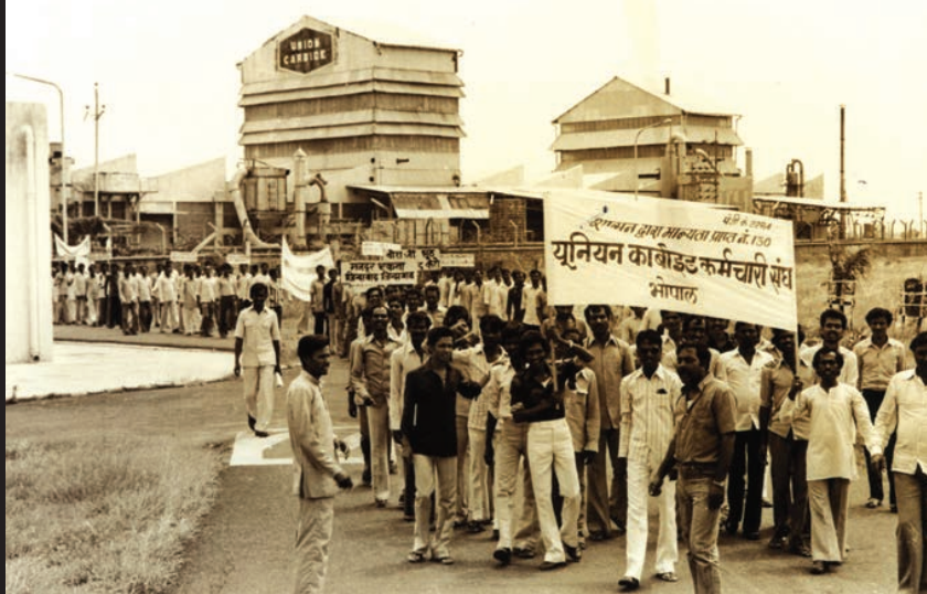
Members of UC Employees Union protesting

The disaster was not an accident. UC had deliberately ignored the essential safety measures in order to cut costs. Much before the Bhopal disaster, there had been incidents of gas leak killing a worker and injuring several.