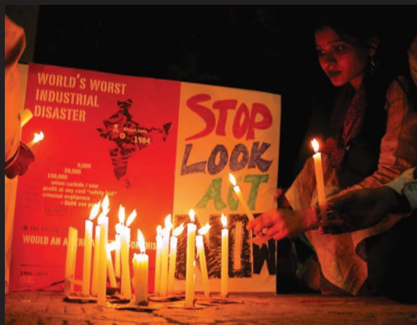
The struggle for justice goes on...

24 years later, people are still fighting for justice: for safe drinking water, for health-care facilities and jobs for the people poisoned by UC. They also demand that Anderson, the UC chairman who faces criminal charges, be prosecuted.