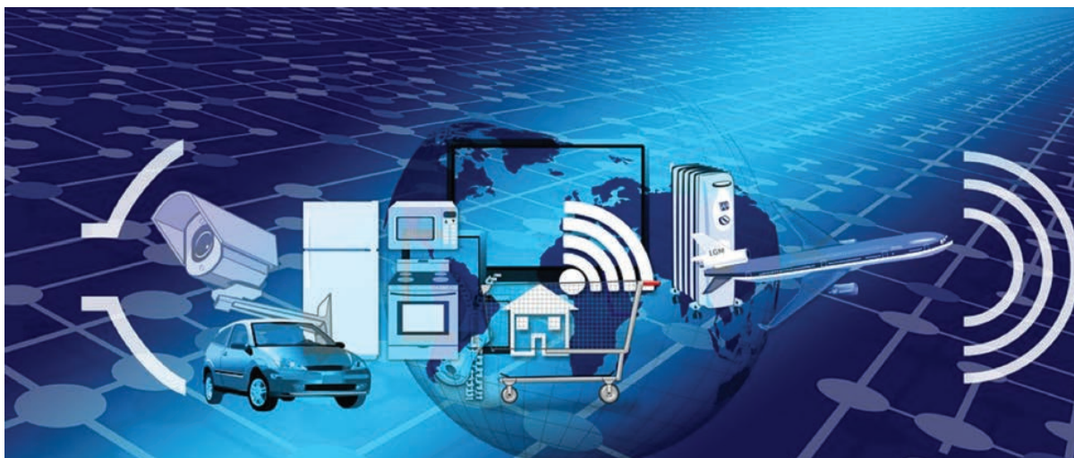
Figure 1.2: ICT Around Us

digital television. In addition to printed newspapers now we also have their electronic versions. Along with traditional radio, we also have online radio.