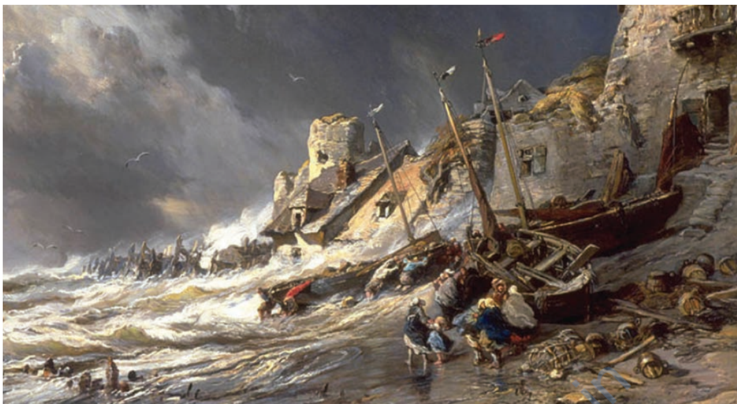
Figure 1.1: Coast Scene

Technology refers to methods, systems and devices, which are a result of scientific knowledge, being used for practical purposes. For example, Muskan went to an excursion to Bhubaneswar and visited the State Museum. She saw various mineral ores in the mineral section of the museum. She decided to capture photographs to share with others who may not have seen the ores. She borrowed her teacher's mobile and clicked pictures of the rare collection. She shared all the pictures on her blog along with a description of the ores. Many viewers commented and appreciated Muskan for sharing those pictures and description.