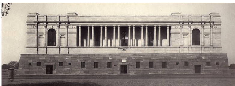
Fig. 4 – The National Archives of India came up in the 1920s

In the early years of the nineteenth century, these documents were carefully copied out and beautifully written by calligraphists – that is, by those who specialised in the art of beautiful writing. By the middle of the nineteenth century, with the spread of printing, multiple copies of these records were printed as proceedings of each government department.