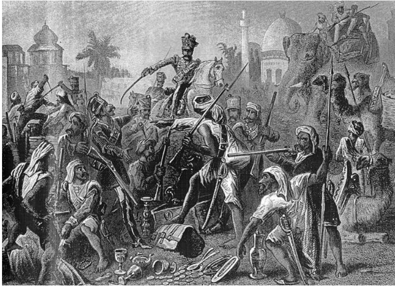
Fig. 7 – The rebels of 1857

Images need to be carefully studied for they project the viewpoint of those who create them. This image can be found in several illustrated books produced by the British after the 1857 rebellion. The caption at the bottom says: “Mutinous sepoy[s] share the loot”. In British representations, the rebels appear as greedy, vicious and brutal. You will read about the rebellion in Chapter 5.