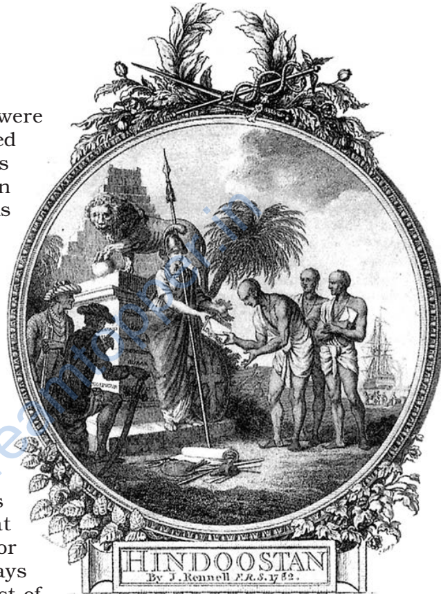
Fig. 1 – Brahmans offering the Shastras to Britannia, frontispiece to the first map produced by James Rennel, 1782

Living in the world we do not always ask historical questions about what we see around us. We take things for granted, as if what we see has always been in the world we inhabit. But most of us have our moments of wonder, when we are curious, and we ask questions that actually are historical. Watching someone sip a cup of tea at a roadside tea stall, you may wonder – when did people begin to drink tea or coffee? Looking out of the window of a train you may ask yourself – when were railways built and how did people travel long distances before the age of railways? Reading the newspaper in the morning you may be curious to know how people got to hear about things before newspapers began to be printed.