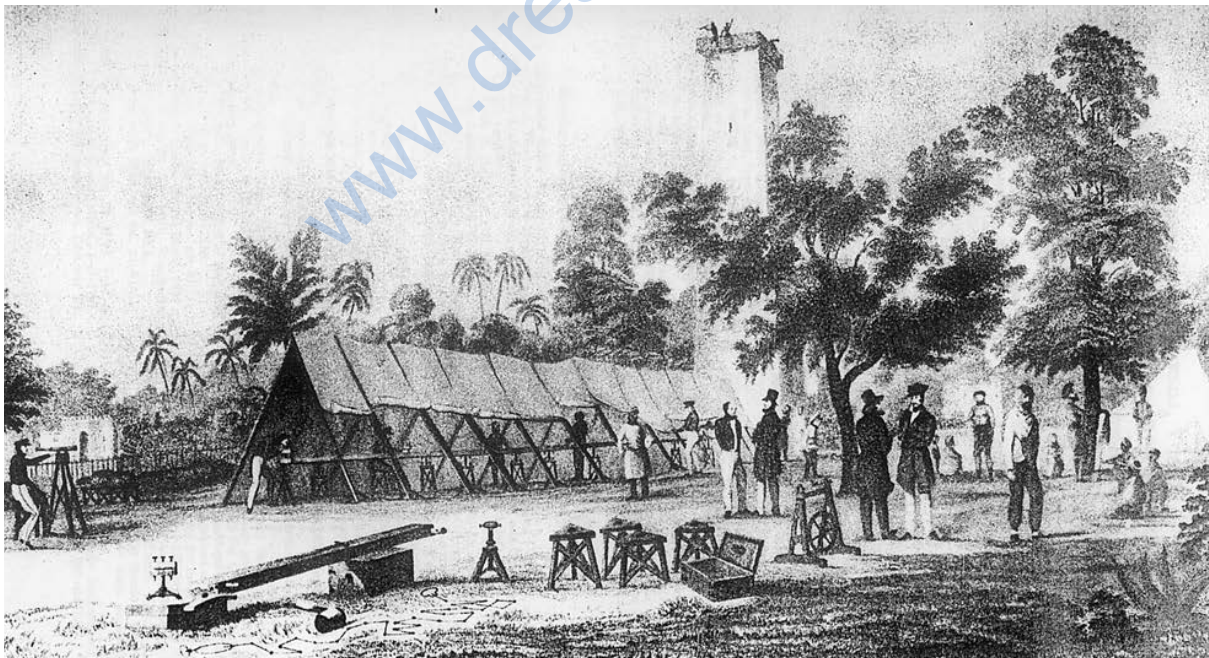
Fig. 6 – Mapping and survey operations in progress in Bengal, a drawing by James Prinsep, 1832

From this vast corpus of records we can get to know a lot, but we must remember that these are official records. They tell us what the officials thought, what