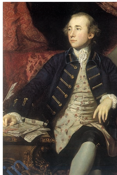
Fig. 3 – Warren Hastings became the first Governor-General in 1773. While history books narrated the deeds of Governor-Generals, biographies glorified them as persons, and paintings projected them as powerful figures.

Mill thought that all Asian societies were at a lower level of civilisation than Europe. According to his telling of history, before the British came to India, Hindu and Muslim despots ruled the country. Religious intolerance, caste taboos and superstitious practices dominated social life. British rule, Mill felt, could civilise India. To do