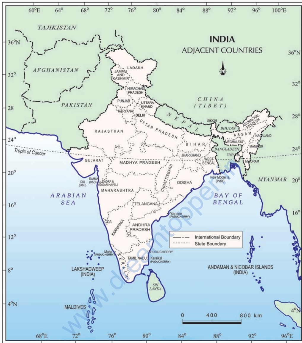
Figure 1.5 : India and Adjacent Countries

Sri Lanka and Maldives. Sri Lanka is separated from India by a narrow channel of sea formed by the Palk Strait and the Gulf of Mannar, while Maldives Islands are situated to the south of the Lakshadweep Islands.