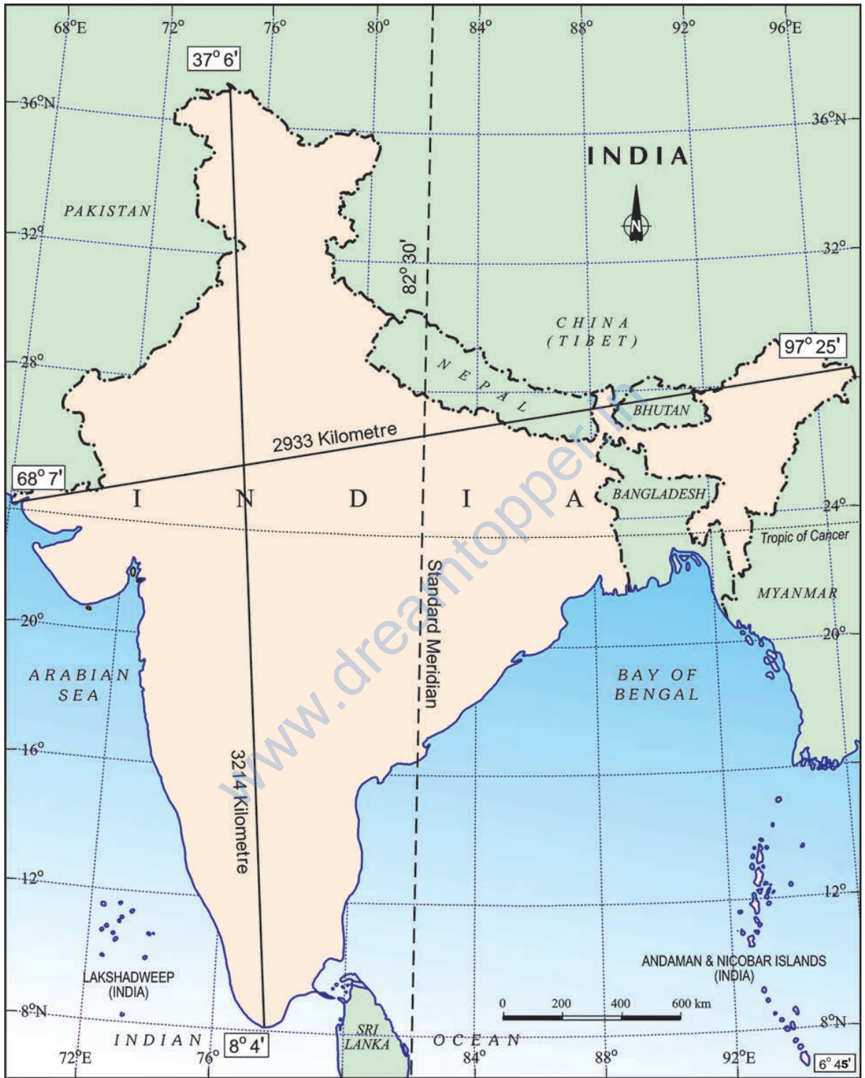
Figure 1.3 : India : Extent and Standard Meridian