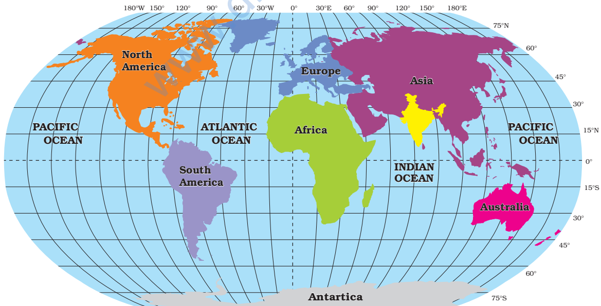
Figure 1.1 : India in the World

The land mass of India has an area of 3.28 million square km. India's total area accounts for about 2.4 per cent of the total geographical