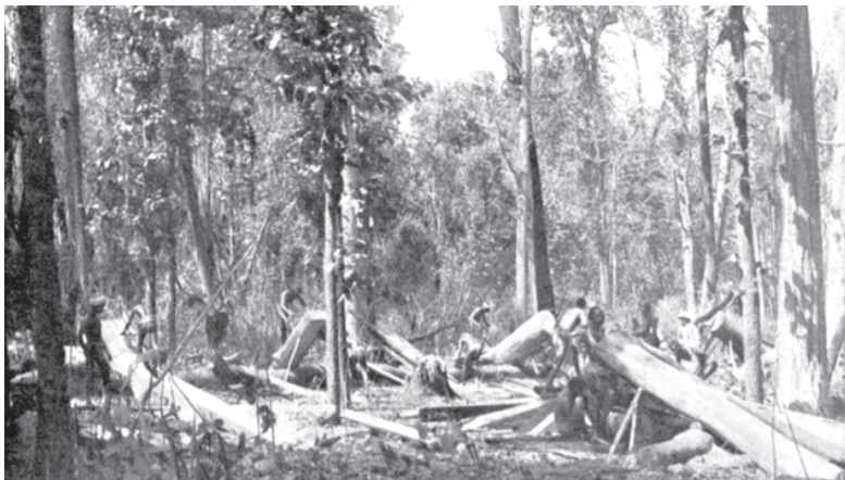
Fig.3 – Converting sal logs into sleepers in the Singhbhum forests, Chhotanagpur, May 1897. Adivasis were hired by the forest department to cut trees, and make smooth planks which would serve as sleepers for the railways. At the same time, they were not allowed to cut these trees to build their own houses.