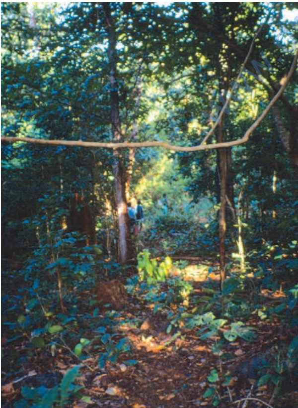
Fig. 1 – A sal forest in Chhattisgarh.

A lot of this diversity is fast disappearing. Between 1700 and 1995, the period of industrialisation, 13.9 million sq km of forest or 9.3 per cent of the world's total area was cleared for industrial uses, cultivation, pastures and fuelwood.