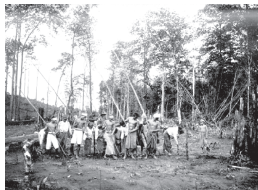
Fig. 15 – Taungya cultivation was a system in which local farmers were allowed to cultivate temporarily within a plantation. In this photo taken in Tharrawaddy division in Burma in 1921 the cultivators are sowing paddy. The men make holes in the soil using long bamboo poles with iron tips. The women sow paddy in each hole.

Children living around forest areas can often identify hundreds of species of trees and plants. How many species of trees can you name?