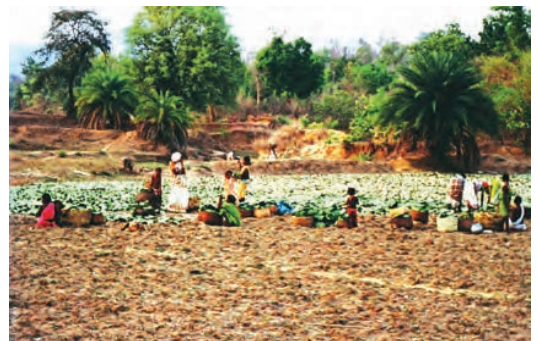
Fig. 13 – Drying tendu leaves.

The Forest Act meant severe hardship for villagers across the country. After the Act, all their everyday practices – cutting wood for their