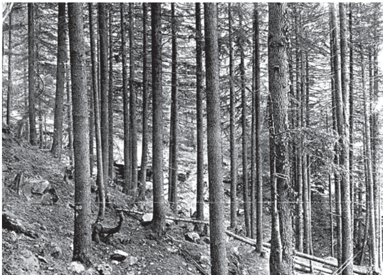
Fig. 10 – A deodar plantation in Kangra, 1933. From Indian Forest Records , Vol. XV.

punished. So Brandis set up the Indian Forest Service in 1864 and helped formulate the Indian Forest Act of 1865. The Imperial Forest Research Institute was set up at Dehradun in 1906. The system they taught here was called ‘ scientific forestry ’. Many people now, including ecologists, feel that this system is not scientific at all.