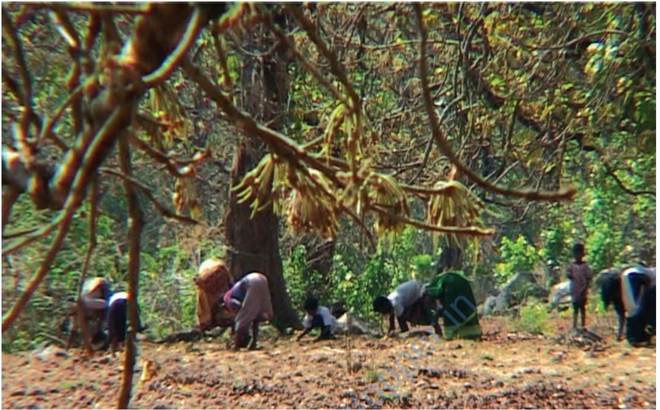
Fig. 12 – Collecting mahua ( Madhuca indica ) from the forests.

Villagers wake up before dawn and go to the forest to collect the mahua flowers which have fallen on the forest floor. Mahua trees are precious. Mahua flowers can be eaten or used to make alcohol. The seeds can be used to make oil.