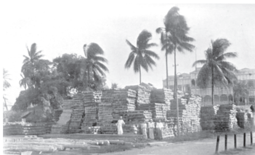
Fig.23 – Indian Munitions Board, War Timber Sleepers piled at Soolay pagoda ready for shipment, 1917.

The Allies would not have been as successful in the First World War and the Second World War if they had not been able to exploit the resources and people of their colonies. Both the world wars had a devastating effect on the forests of India, Indonesia and elsewhere. The forest department cut freely to satisfy war needs.