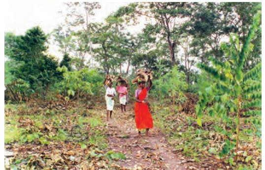
Fig.6 - Women returning home after collecting fuelwood.