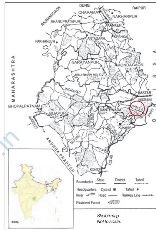
Fig.20 – Bastar in 2000.

Bastar is located in the southernmost part of Chhattisgarh and borders Andhra Pradesh, Orissa and Maharashtra. The central part of Bastar is on a plateau. To the north of this plateau is the Chhattisgarh plain and to its south is the Godavari plain. The river Indravati winds across Bastar east to west. A number of different communities live in Bastar such as Maria and Muria Gonds, Dhurwas, Bhatras and Halbas. They speak different languages but share common customs and beliefs. The people of Bastar believe that each village was given its land by the Earth, and in return, they look after