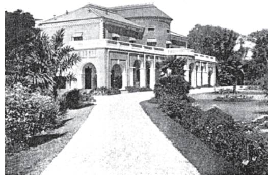
Fig. 11 – The Imperial Forest School, Dehra Dun, India. The first forestry school to be inaugurated in the British Empire.

Foresters and villagers had very different ideas of what a good forest should look like. Villagers wanted forests with a mixture of species to satisfy different needs – fuel, fodder, leaves. The forest department on the other hand wanted trees which were suitable for building