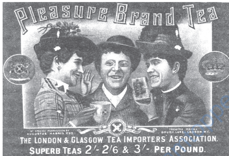
Fig.8 – Pleasure Brand Tea.

Large areas of natural forests were also cleared to make way for tea, coffee and rubber plantations to meet Europe's growing need for these commodities. The colonial government took over the forests, and gave vast areas to European planters at cheap rates. These areas were enclosed and cleared of forests, and planted with tea or coffee.