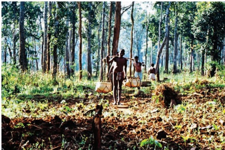
Fig. 14 – Bringing grain from the threshing grounds to the field.

The men are carrying grain in baskets from the threshing fields. Men carry the baskets slung on a pole across their shoulders, while women carry the baskets on their heads.