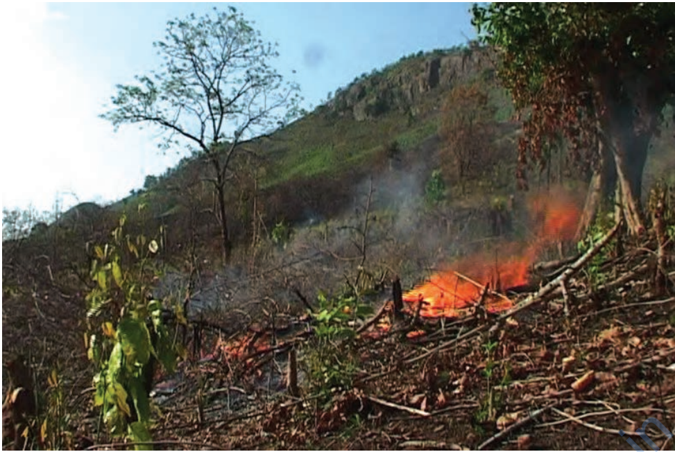
Fig.16 – Burning the forest penda or podu plot. In shifting cultivation, a clearing is made in the forest, usually on the slopes of hills. After the trees have been cut, they are burnt to provide ashes. The seeds are then scattered in the area, and left to be irrigated by the rain.

Shifting cultivation also made it harder for the government to calculate taxes. Therefore, the government decided to ban shifting cultivation. As a result, many communities were forcibly displaced from their homes in the forests. Some had to change occupations, while some resisted through large and small rebellions.