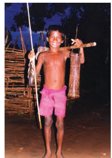
Fig.17 – The little fisherman. Children accompany their parents to the forest and learn early how to fish, collect forest produce and cultivate. The bamboo trap which the boy is holding in his right hand is kept at the mouth of a stream – the fish flow into it.

While the forest laws deprived people of their customary rights to hunt, hunting of big game became a sport. In India, hunting of tigers and other animals had been part of the culture of the court and nobility for centuries. Many Mughal paintings show princes and emperors enjoying a hunt. But under colonial rule the scale of hunting increased to such an extent that various species became almost extinct. The British saw large animals as signs of a wild, primitive and savage society. They believed that by killing dangerous animals the British