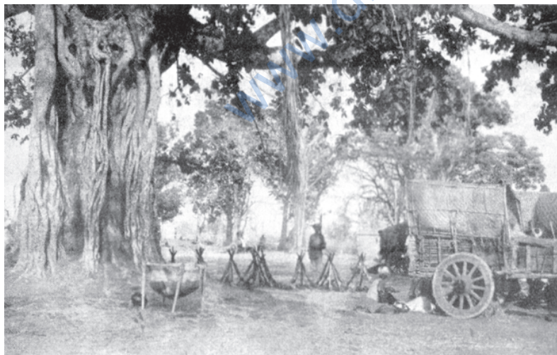
Fig.19 – Army camp in Bastar, 1910.

In 1947 Bastar kingdom was merged with Kanker kingdom and became Bastar district in Madhya Pradesh. In 1998 it was divided again into three districts, Kanker, Bastar and Dantewada. In 2001, these became part of Chhattisgarh. The 1910 rebellion first started in the Kanger forest area (encircled) and soon spread to other parts of the state.