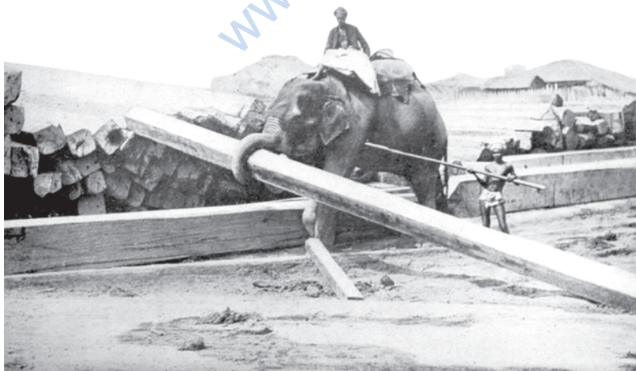
Fig.5 – Elephants piling squares of timber at a timber yard in Rangoon. In the colonial period elephants were frequently used to lift heavy timber both in the forests and at the timber yards.