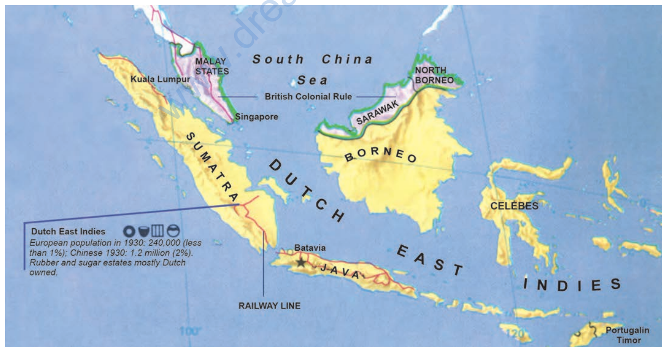
Fig. 22 – Most of Indonesia's forests are located in islands like Sumatra, Kalimantan and West Irian. However, Java is where the Dutch began their 'scientific forestry'. The island, which is now famous for rice production, was once richly covered with teak.

Dirk van Hogendorp, cited in Peluso, Rich Forests, Poor People , 1992.