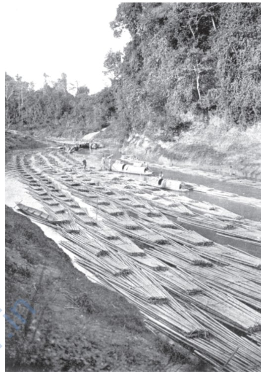
Fig.4 – Bamboo rafts being floated down the Kassalong river, Chittagong Hill Tracts.

From the 1860s, the railway network expanded rapidly. By 1890, about 25,500 km of track had been laid. In 1946, the length of the tracks had increased to over 765,000 km. As the railway tracks spread through India, a larger and larger number of trees were felled. As early as the 1850s, in the Madras Presidency alone, 35,000 trees were being cut annually for sleepers. The government gave out contracts to individuals to supply the required quantities. These contractors began cutting trees indiscriminately. Forests around the railway tracks fast started disappearing.