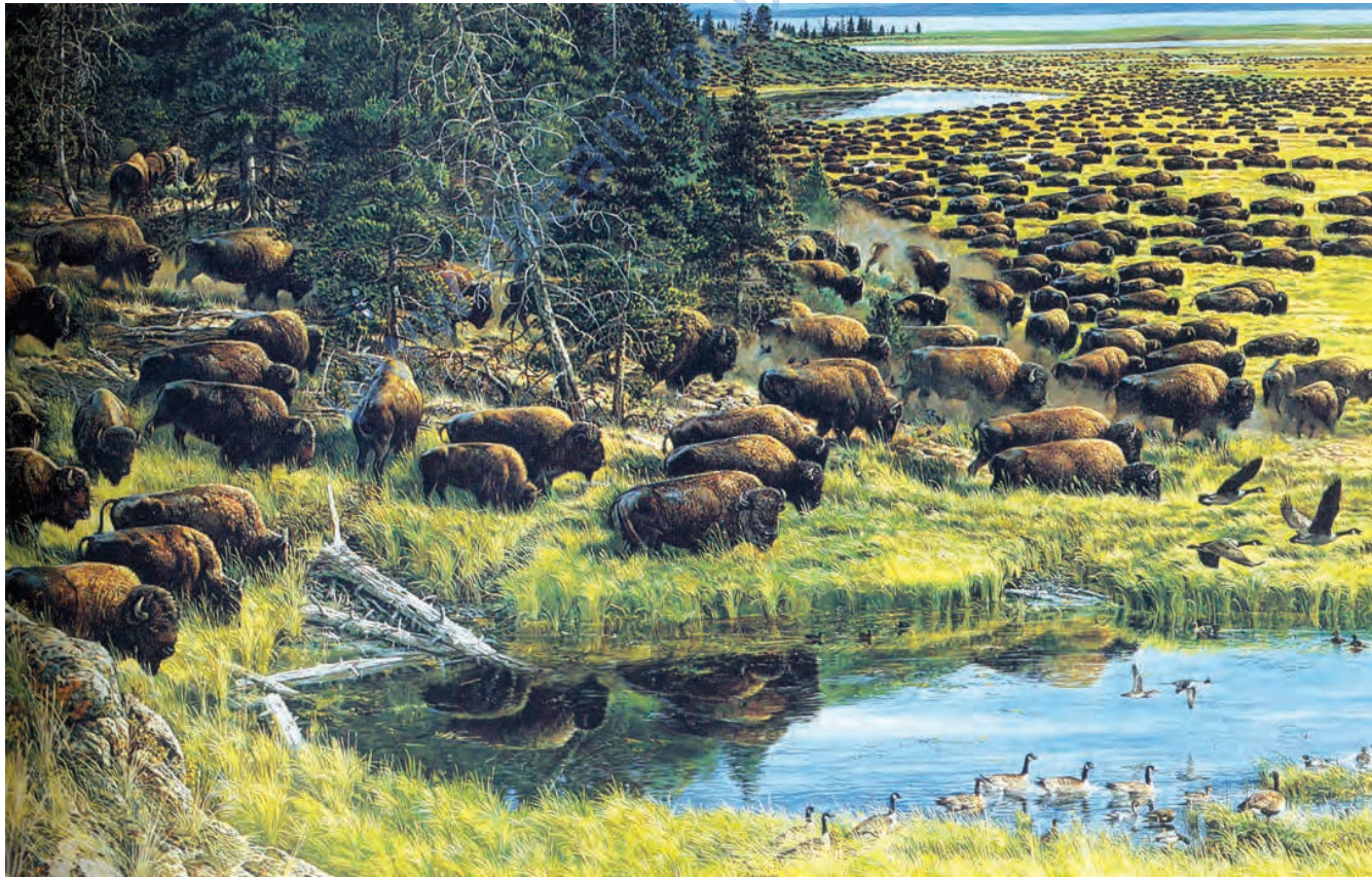
Fig.2 – When the valleys were full. Painting by John Dawson. Native Americans like the Lakota tribe who lived in the Great North American Plains had a diversified economy. They cultivated maize, foraged for wild plants and hunted bison. Keeping vast areas open for the bison to range in was seen by the English settlers as wasteful. After the 1860s the bison were killed in large numbers.

In 1600, approximately one-sixth of India's landmass was under cultivation. Now that figure has gone up to about half. As population increased over the centuries and the demand for food went up, peasants extended the boundaries of cultivation, clearing forests and breaking new land. In the colonial period, cultivation expanded rapidly for a variety of reasons. First, the British directly encouraged