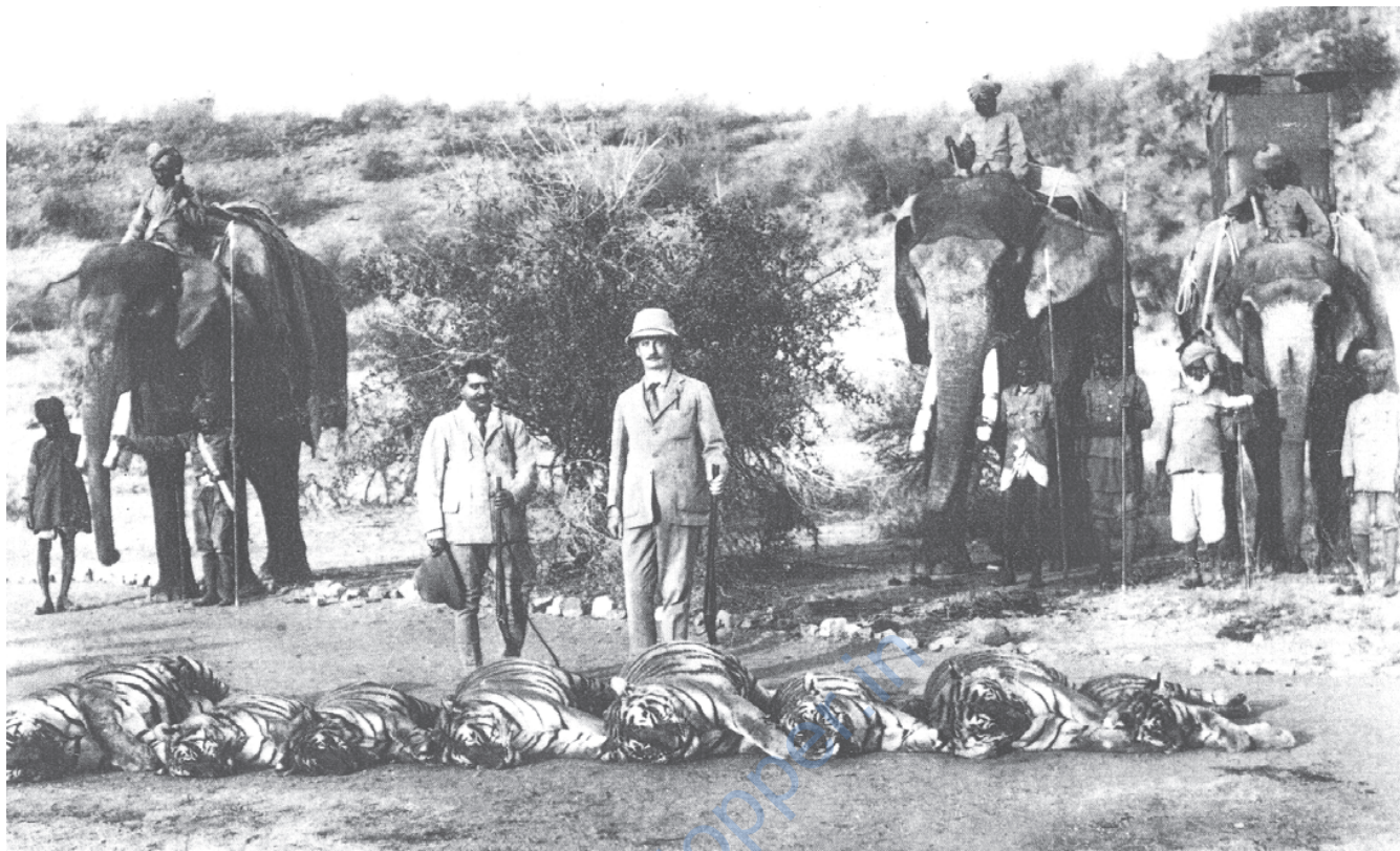
Fig. 18 – Lord Reading hunting in Nepal.

Count the dead tigers in the photo. When British colonial officials and Rajas went hunting they were accompanied by a whole retinue of servants. Usually, the tracking was done by skilled village hunters, and the Sahib simply fired the shot.