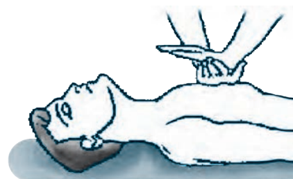
Fig. 12.2 : Steps for CPR in the case of drowning