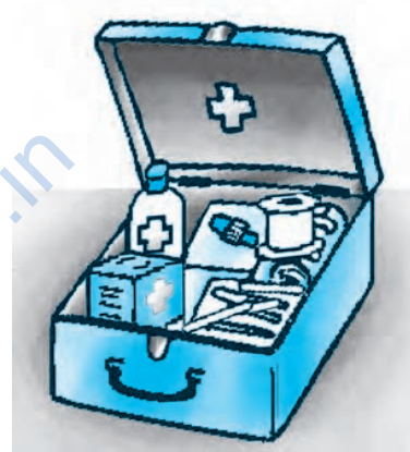
Fig. 12.1 : First Aid Box

Having studied first-aid, you are prepared to give others some instruction in first-aid, to promote among them a reasonable safety attitude and to assist them wisely if they are stricken. There is always an obligation on a humanitarian basis to assist the sick and the helpless. There is no greater satisfaction than that resulting from relieving suffering or saving a life.