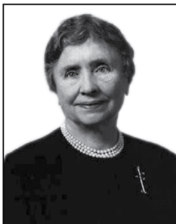
Helen A. Keller