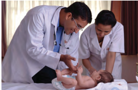
Most babies do not get basic healthcare

The problem does not end with Infant Mortality Rate. The last column of table 1.4 shows that about half of the children aged 14-15 in Bihar are not attending school beyond Class 8. This means that if you went to school in Bihar nearly half of your elementary class friends would be missing. Those who could have been in school are not there! If this had happened to you, you would not be able to read what you are reading now.