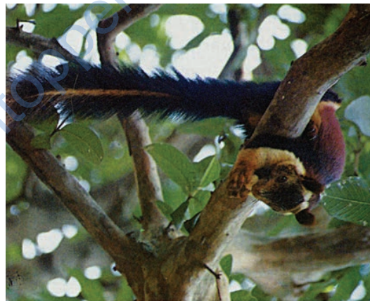
Fig. 5.3 (b) : Giant squirrel

endemic flora of the Pachmarhi Biosphere Reserve. Bison, Indian giant squirrel [Fig. 5.3 (b)] and flying squirrel are endemic fauna of this area. Professor Ahmad explains that the destruction of their habitat, increasing population and introduction of new species may affect the natural habitat of endemic species and endanger their existence.