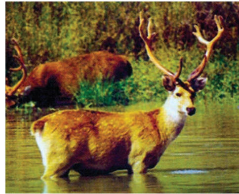
Fig. 5.6 : Barasingha

animals has become difficult because of disturbances in their natural habitat. Professor Ahmad tells them that in order to protect plants and animals strict rules are imposed in all National Parks. Human activities such as grazing, poaching, hunting, capturing of animals or collection of firewood, medicinal plants, etc. are not allowed