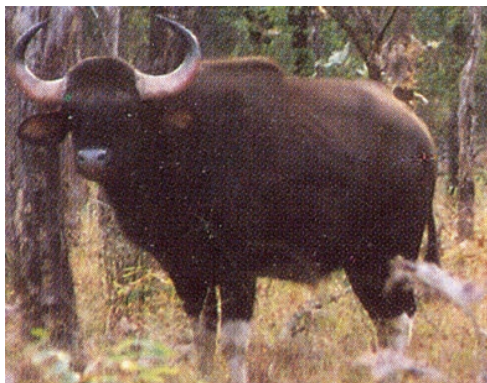
Fig. 5.5 : Wild buffalo

buffaloes (Fig. 5.5) and barasingha (Fig. 5.6) were also found in the Satpura National Park. Animals whose numbers are diminishing to a level that they might face extinction are known as the endangered animals . Boojho is reminded of the dinosaurs which became extinct a long time ago. Survival of some