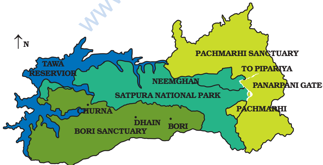
Fig. 5.1 : Pachmarhi Biosphere Reserve