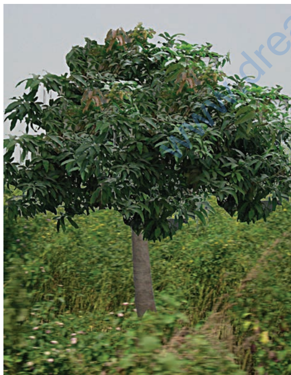
Fig. 5.3 (a) : Wild Mango

Madhavji shows sal and wild mango (Fig. 5.3 (a)) as two examples of the