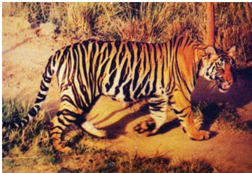
Fig. 5.4 : Tiger

Tiger (Fig. 5.4) is one of the many species which are slowly disappearing from our forests. But, the Satpura Tiger Reserve is unique in the sense that a significant increase in the population of tigers has been seen here. Once upon a time, animals like lions, elephants, wild