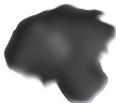
Fig. 3.3: Coal tar

It is a black, thick liquid (Fig. 3.3) with an unpleasant smell. It is a mixture of