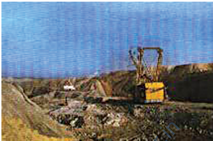
Fig. 3.2: A coal mine

When heated in air, coal burns and produces mainly carbon dioxide gas.