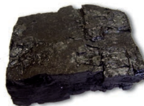
Fig. 3.1: Coal

You may have seen coal or heard about it (Fig. 3.1). It is as hard as stone and is black in colour.