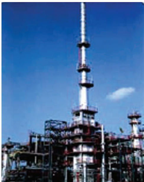
Fig. 3.5: A petroleum refinery

separating the various constituents/ fractions of petroleum is known as refining. It is carried out in a petroleum refinery (Fig. 3.5).