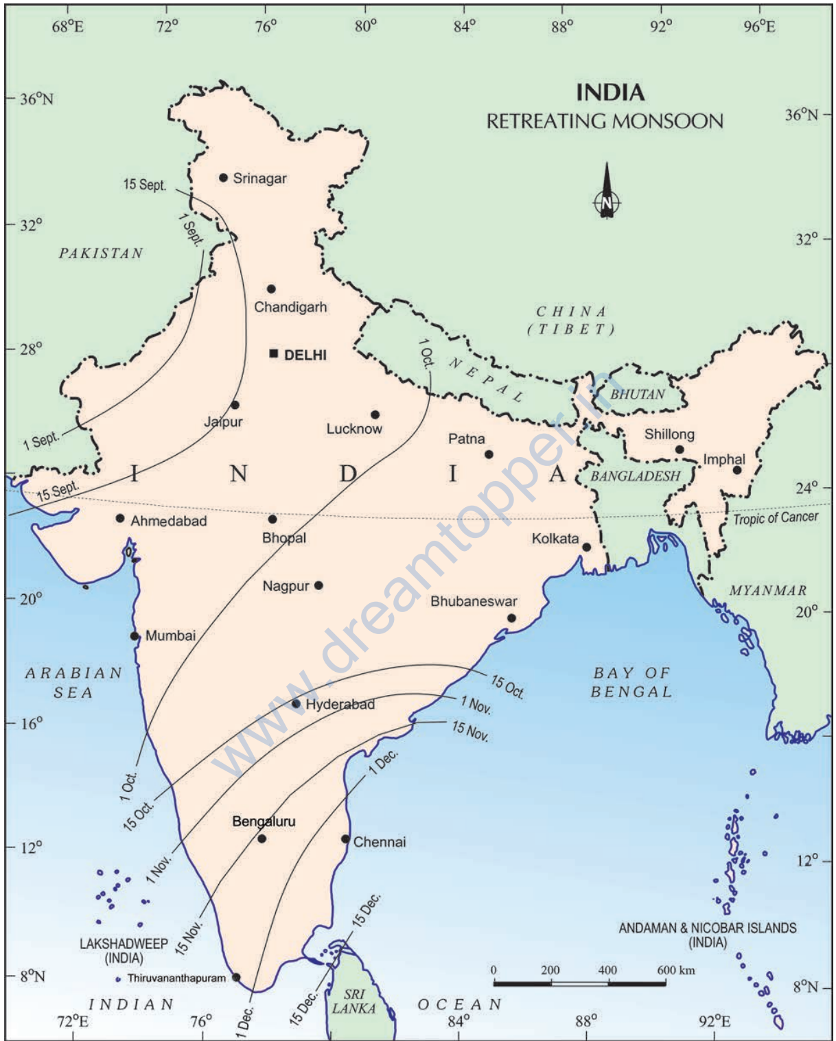
Figure 4.2 : Retreating Monsoon