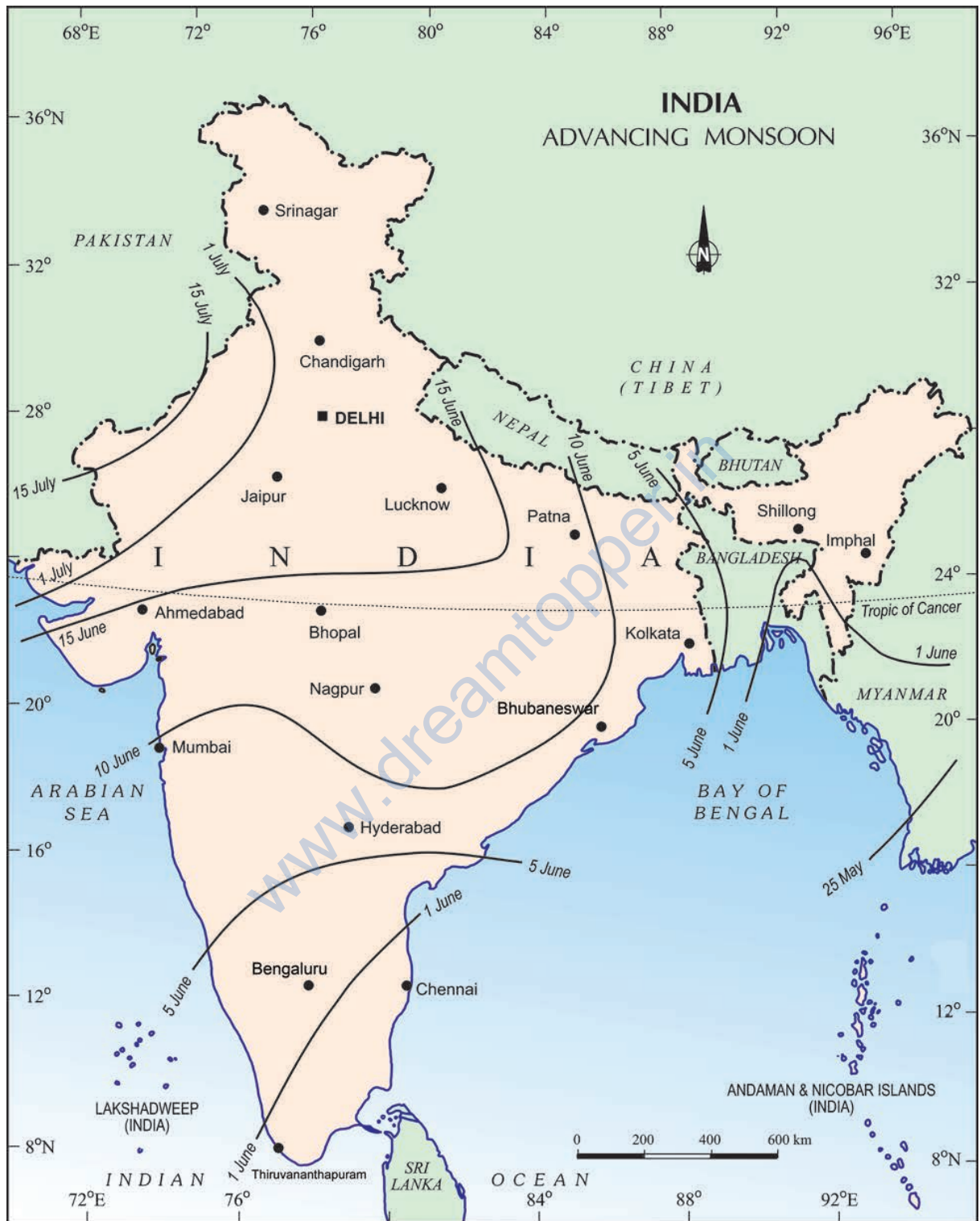
Figure 4.1 : Advancing Monsoon