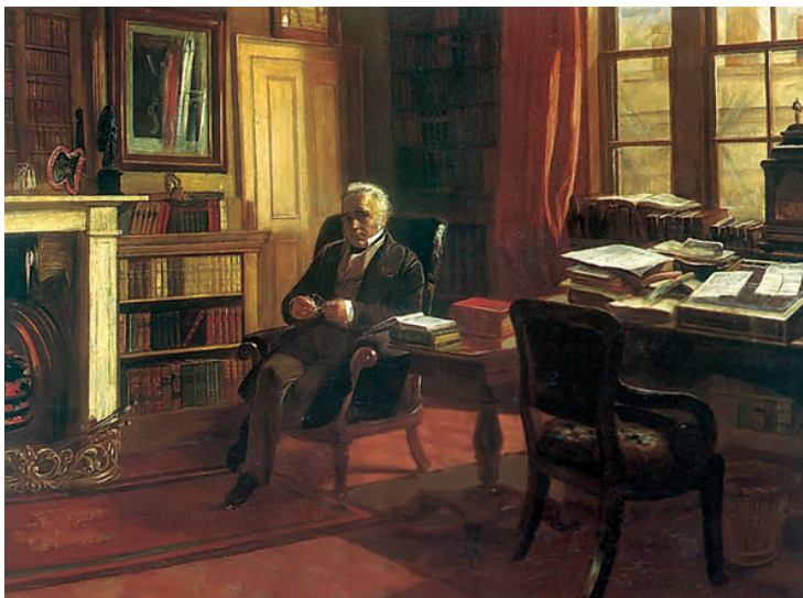
Fig. 4 – Thomas Babington Macaulay in his study

“a single shelf of a good European library was worth the whole native literature of India and Arabia”. He urged that the British government in India stop wasting public money in promoting Oriental learning, for it was of no practical use.