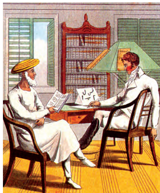
Fig. 1 – William Jones learning Persian

In 1783, a person named William Jones arrived in Calcutta. He had an appointment as a junior judge at the Supreme Court that the Company had set up. In addition to being an expert in law, Jones was a linguist . He had studied Greek and Latin at Oxford, knew French and English, had picked up Arabic from a friend, and had also learnt Persian. At Calcutta, he began spending many hours a day with pandits who taught him the subtleties of Sanskrit language, grammar and