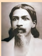
Fig. 9 – Sri Aurobindo Ghose

In a speech delivered on January 15, 1908 in Bombay, Aurobindo Ghose stated that the goal of national education was to awaken the spirit of nationality among the students. This required a contemplation of the heroic deeds of our ancestors. The education should be imparted in the vernacular so as to reach the largest number of people. Aurobindo Ghose emphasised that although the students should remain connected to their own roots, they should also take the fullest advantage of modern scientific discoveries and Western experiments in popular governments. Moreover, the students should also learn some useful crafts so that they could be able to find some moderately remunerative employment after leaving their schools.