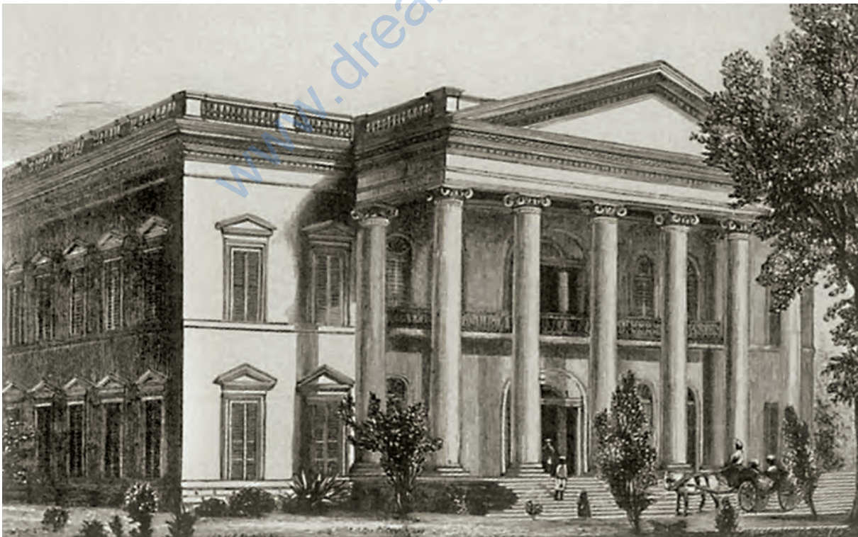
Fig. 7 – Serampore College on the banks of the river Hooghly near Calcutta

Over the nineteenth century, missionary schools were set up all over India. After 1857, however, the British government in India was reluctant to directly support missionary education. There was a feeling that any strong attack on local customs, practices, beliefs and religious ideas might enrage “native” opinion.