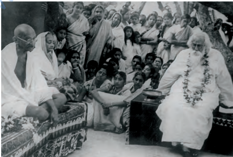
Fig. 10 – Mahatma Gandhi along with Kasturba Gandhi sitting with Rabindranath Tagore and a group of girls at Santiniketan, 1940

Western education, Mahatma Gandhi said, focused on reading and writing rather than oral knowledge; it valued textbooks rather than lived experience and practical knowledge. He argued that education ought to develop a person’s mind and soul. Literacy – or simply learning to read and write – by itself did not count as education. People had to work with their hands, learn a craft, and know how different things operated. This would develop their mind and their capacity to understand.