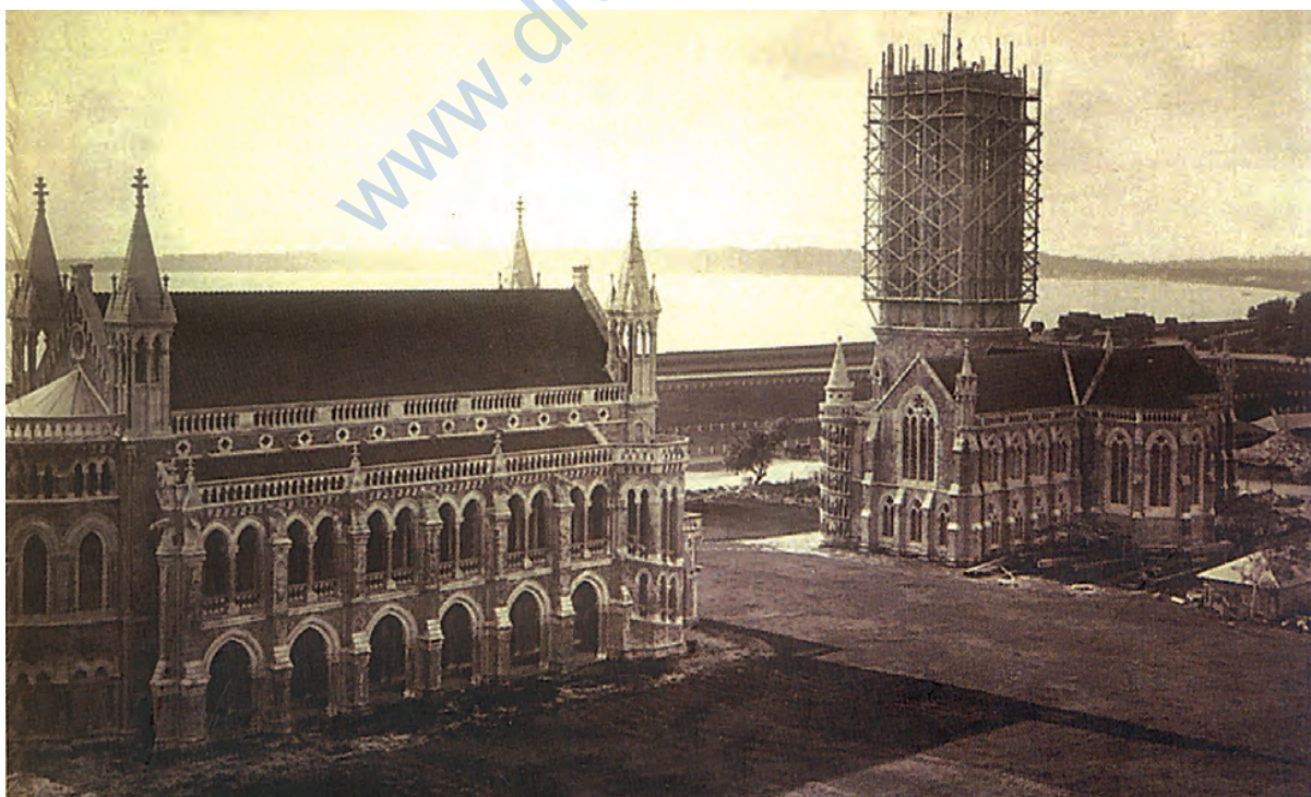
Fig. 5 – Bombay University in the nineteenth century

We must emphatically declare that the education which we desire to see extended in India is that which has for its object the diffusion of the improved arts, services, philosophy, and literature of Europe, in short, European knowledge.