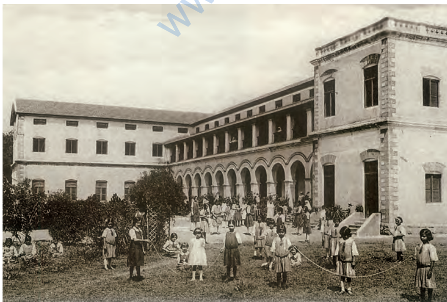
Fig. 12 – Children playing in a missionary school in Coimbatore, early twentieth century

Many individuals and thinkers were thus thinking about the way a national educational system could be fashioned. Some wanted changes within the system set up by the British, and felt that the system could be extended so as to include wider sections of people. Others urged that alternative systems be created so that people were educated into a culture that was truly national. Who was to define what was truly national? The debate about what this “national education” ought to be continued till after independence.