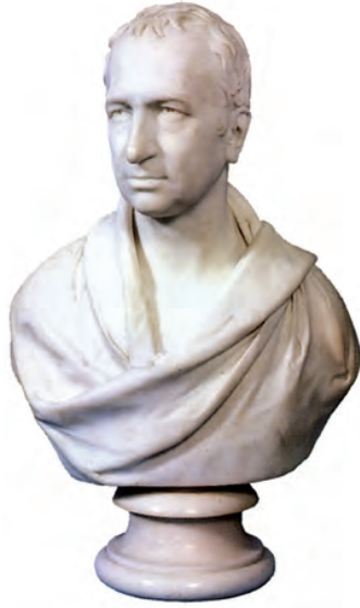
Fig. 2 – Henry Thomas Colebrooke

He was a scholar of Sanskrit and ancient sacred writings of Hinduism.