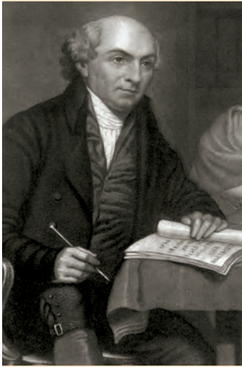
Fig. 6 – William Carey was a Scottish missionary who helped establish the Serampore Mission

The argument for practical education was strongly criticised by the Christian missionaries in India in the nineteenth century. The missionaries felt that education should attempt to improve the moral character of the people, and morality could be improved only through Christian education.