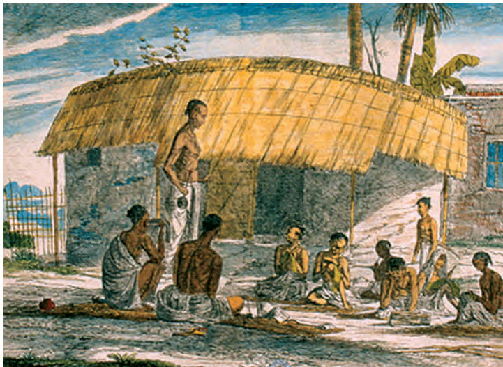
Fig. 8 – A village pathshala

Adam discovered that this flexible system was suited to local needs. For instance, classes were not held during harvest time when rural children often worked in the fields. The pathshala started once again when the crops had been cut and stored. This meant that even children of peasant families could study.