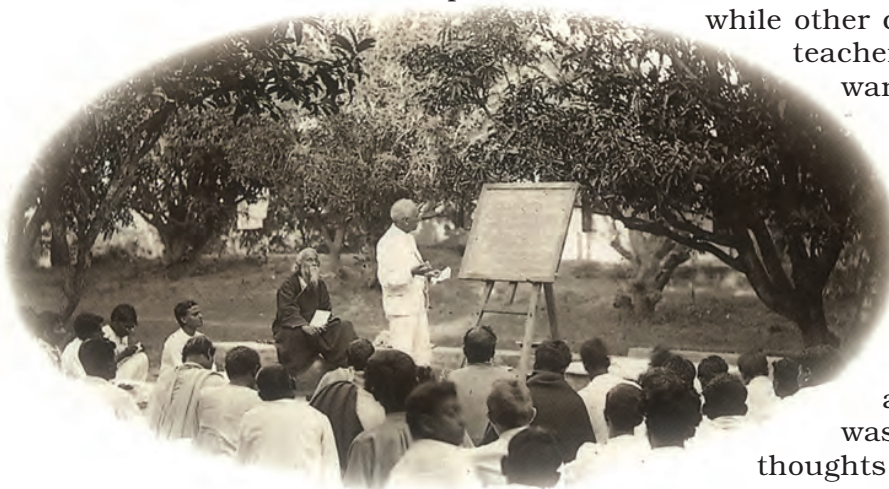
Fig. 11 – A class in progress in Santiniketan in the 1930s Notice the surroundings – the trees and the open spaces.

The experience of his schooldays in Calcutta shaped Tagore’s ideas of education. On growing up, he wanted to set up a school where the child was happy, where she could be free and creative, where she was able to explore her own thoughts and desires. Tagore felt