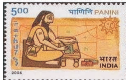
Postage stamp of Indian grammarian, Panini

Takshashila became famous as a place of learning due to its teachers' expertise. Among its noted pupils were the legendary Indian grammarian, Panini. He was an expert in language and grammar and authored one of the greatest works on grammar called Ashtadhyayi . Jivaka, one of the most renowned physicians in ancient India, and Chanakya (also known as Kautilya), a skilled exponent of statecraft, both studied here. Students came to Takshashila from Kashi, Kosala, Magadha and also from other countries in spite of the long and arduous journey they had to undertake.