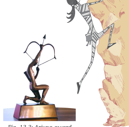
Fig. 13.3: Arjuna award

Government instituted MAKATrophy in 1956-57 as a tool for promoting the competitive sport amongst colleges and Universities. The top overall performing University in the Inter-University tournaments in India is given the MAKATrophy, which is a rolling trophy along with cash prize. The cash prize has also been recently enhanced to Rs.10 lakh, Rs. 5 lakh and Rs.3 lakh for the Universities securing first, second and third position respectively in Inter-University tournaments.