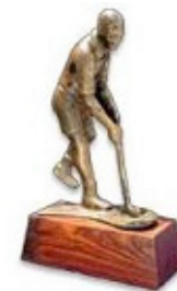
Fig. 13.4: Dhyan Chand award