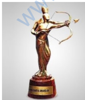
Fig. 13.2: Dronacharya award

The Rajiv Gandhi Khel Ratna award was instituted in the year 1991-92. It is India's highest honour given for achievement in sport. The words "Khel Ratna" literally mean "Sport Gem" in Hindi. The award is named after the late Rajiv Gandhi, former Prime Minister of India. It carries a medal, a scroll of honour and a cash component of ₹ 7,50,000. The Khel Ratna was devised to be an overarching honour, conferred for outstanding sporting performance, whether by an individual or a team, across all sporting disciplines in a given year.