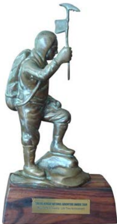
Fig. 13.7: TNNA Award