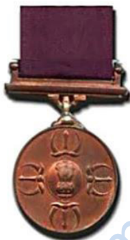
Fig. 13.1: Rajiv Gandhi Khel Ratna

Sport awards in India are presented by the Government of India to honour the players who have performed very well in their field of sport. It is bestowed to various sport personalities in different fields for their accomplishments and outstanding performances and to enhance the enthusiasm of players and recognise their skills and achievements. All the 7 awards are given to the proud recipient on National Sport Day every year i.e. 29 August to mark and celebrate the birthday of hockey Maestro Major Dhyanchand. These awards include the Trophy Rajiv Gandhi Khel Ratna Award, Arjuna Award, the Maulana Abul Kalam Azad (MAKA) Award, the, the Dronacharya Awards and the Dhyan Chand Award. Very recently the sport category also has been added in the list of areas for which Bharat Ratna is conferred.