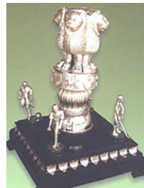
Fig. 13.5: Maka trophy