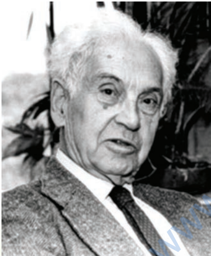
Ernst Mayr (1904 – 2004)

Born on 5 July 1904, in Kempten, Germany, ERNST MAYR, the Harvard University evolutionary biologist who has been called 'The Darwin of the 20 th century', was one of the 100 greatest scientists of all time. Mayr joined Harvard's Faculty of Arts and Sciences in 1953 and retired in 1975, assuming the title Alexander Agassiz Professor of Zoology Emeritus . Throughout his nearly 80-year career, his research spanned ornithology, taxonomy, zoogeography, evolution, systematics, and the history and philosophy of biology. He almost single-handedly made the origin of species diversity the central question of evolutionary biology that it is today. He also pioneered the currently accepted definition of a biological species. Mayr was awarded the three prizes widely regarded as the triple crown of biology: the Balzan Prize in 1983, the International Prize for Biology in 1994, and the Crafoord Prize in 1999. Mayr died at the age of 100 in the year 2004.