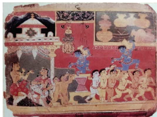
Mitharam , Bhagvata Purana , 1550

With several regions in the north, east and west coming under the rule of the Sultanate dynasties from Central Asia after the late twelfth century, another strain of influence—