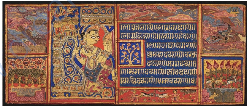
Indra praising Devasano Pado, Kalpasutra, Gujarat, about 1475. Collection: Boston

These paintings were lavishly painted with profuse use of gold and lapis lazuli, indicating the wealth and social status of their patrons.