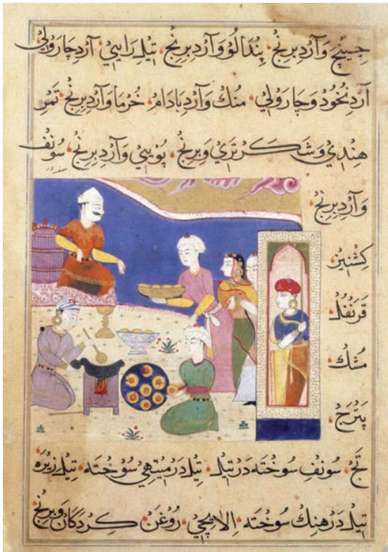
Nimatnama, Mandu, 1550, British Library, London

Persian, Turkic and Afghan—percolated into the mainland and appeared in the paintings patronised by the Sultans of Malwa, Gujarat, Jaunpur and such other centres. With few Central Asian artists in these courts working with local artists, an intermingling of Persian features and indigenous styles led to the emergence of another style that is referred to as the Sultanate School of Painting.