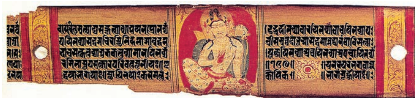
Lokeshvar, Astasahasrika Prajnaparamita, Pala, 1050, National Museum, New Delhi

This practice enabled the dispersal of Pala art to places, such as Nepal, Tibet, Burma, Sri Lanka and Java.