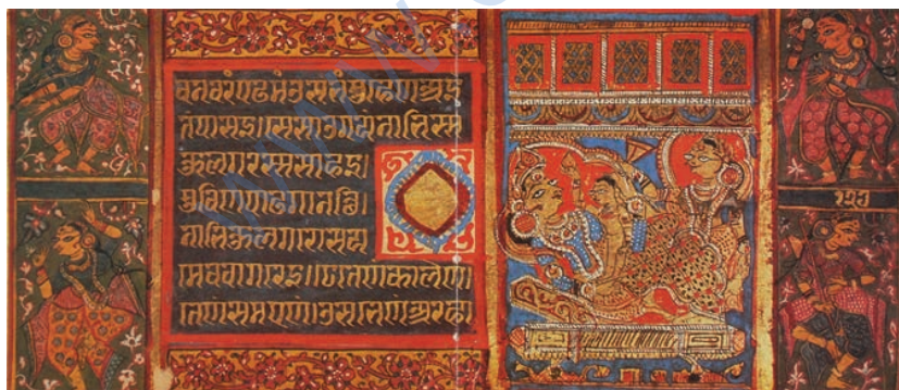
Birth of Mahavir, Kalpasutra, fifteenth century, Jain Bhandar, Rajasthan

Jain painting also received impetus because the concept of shaastradaan (donation of books) gained favour amidst the community, where the act of donating illustrated paintings to the monastery's libraries called bhandars (repositories) was glorified as a gesture of charity, righteousness and gratitude.