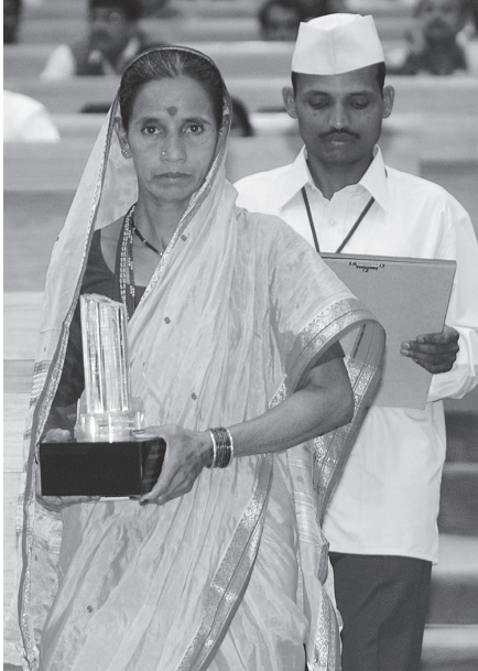
A woman Panch with her reward

importantly, control of local resources is given to the elected local bodies.