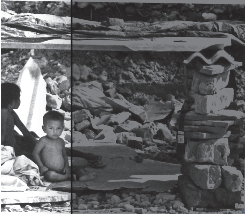
in their demolished house, in New Delhi on July 31.

tries and State these funds must invariably certifying the dates be transferred to panchayats amounts of local gran