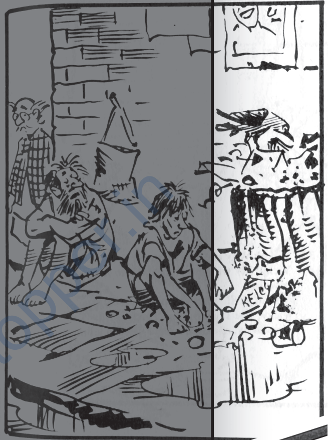
Be careful about what you of poisoning around

s tion was a major media affair. And their elegant paintings and curtains what a future there