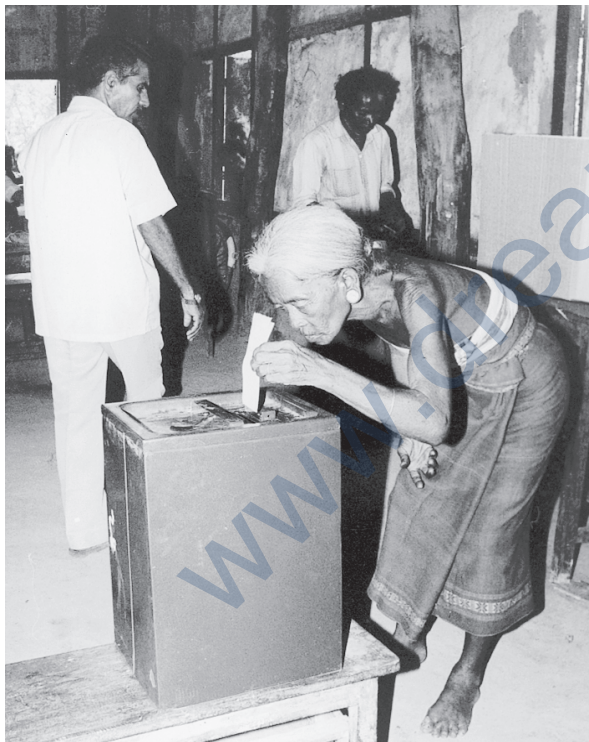
An old lady voting in election

Both the procedures as well as the values that form Indian democracy have developed over the long years of India's anti-colonial struggle. In the last 75 years, since Independence, the success of Indian democracy has been seen as a remarkable feat for a country with such great diversity as well as inequality. This chapter cannot possibly provide a comprehensive account of its rich and complex past and present.