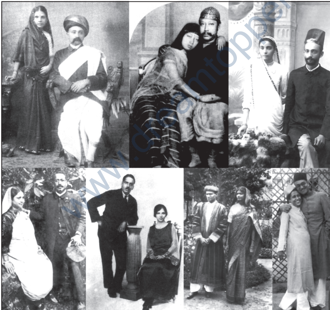
Couples from different regions 1880s to 1930s: Clockwise from top left corner: Gujarat; Tripura; Bombay; Aligarh; Hyderabad; Goa; Calcutta.

Note: In this chapter, the word “State” has a capital S when it is used to denote the federal units within the Indian nation-state; the lower case ‘state’ is used for the broader conceptual category described above.