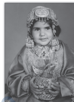
A Kashmiri girl

The sociological sense of minority also implies that the members of the minority form a collectivity – that is, they have a strong sense of group solidarity, a feeling of togetherness and belonging. This is linked to disadvantage because the experience of being subjected to prejudice and discrimination usually heightens feelings of intra-group loyalty and interests (Giddens 2001:248). Thus, groups that may be minorities in a statistical sense, such as people who are left-handed or people born on 29 th February, are not minorities in the sociological sense because they do not form a collectivity.