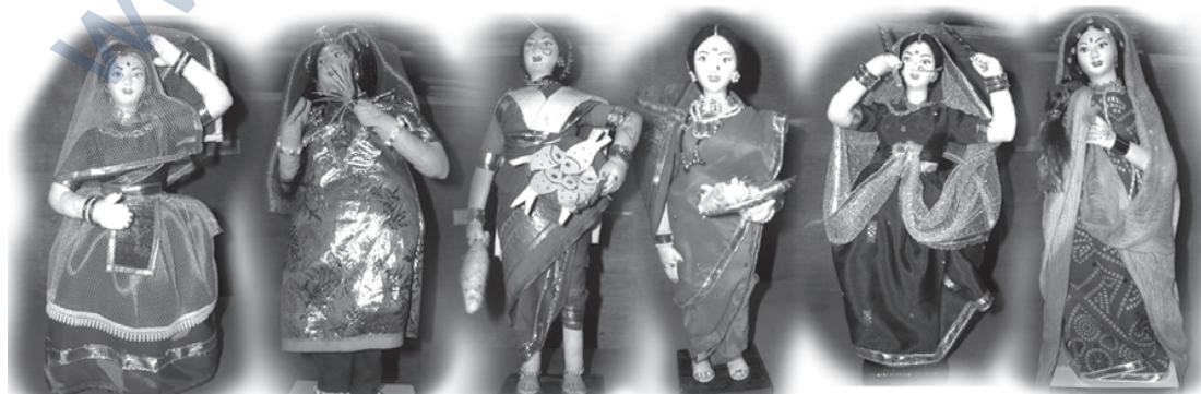
Left Margin: Food from different parts of India; Right top: Child dressed in Kashmiri Clothes; Bottom: Dolls dressed in costumes of different Indian States.

However, it is possible to have anomalous instances where a minority group is disadvantaged in one sense but not in another. Thus, for example, religious minorities like the Parsis or Sikhs may be relatively well-off economically. But they may still be disadvantaged in a cultural sense because of their small numbers relative to the overwhelming majority of Hindus. Religious or cultural minorities need special protection because of the demographic dominance of the majority. In democratic politics, it is always possible to convert a numerical majority into political power through elections. This means that religious or cultural minorities – regardless of their economic or social position – are politically vulnerable. They must face the risk that the majority community will capture political power and use the state machinery to suppress their religious or cultural institutions, ultimately forcing them to abandon their distinctive identity.