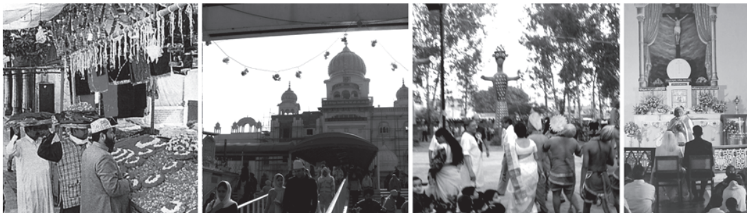
Different religious worship places

(Suggestions: Whites in South Africa before and after the end of apartheid; Hindus in Kashmir; Muslims in Gujarat; Upper castes among Hindus; Tribals in North Eastern states;)