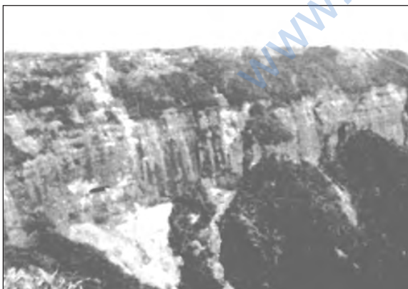
Figure 2.5 : A Part of Peninsular Plateau

Rising from the height of 150 m above the river plains up to an elevation of 600-900 m is the irregular triangle known as the Peninsular plateau. Delhi ridge in the northwest, (extension of Aravalis), the Rajmahal hills in the east, Gir range in the west and the Cardamom hills in the south constitute the outer extent of the Peninsular plateau. However, an extension of this is also seen in the northeast, in the form of Shillong and Karbi-Anglong plateau. The Peninsular India is made up of a series of patland plateaus such as the Hazaribagh