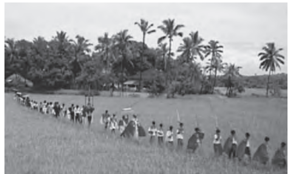
Figure 2.7 : Coastal Plains

As compared to the western coastal plain, the eastern coastal plain is broader and is an example of an emergent coast. There are well-developed deltas here, formed by the rivers flowing eastward in to the Bay of Bengal. These include the deltas of the Mahanadi, the Godavari, the Krishna and the Kaveri. Because of its emergent nature, it has less number of ports and harbours. The continental shelf extends up to 500 km into the sea, which makes it difficult for the development of good ports and harbours. Name some ports on the eastern coast.