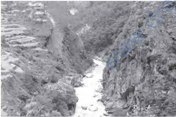
Figure 2.1 : A Gorge

The Himalayas along with other Peninsular mountains are young, weak and flexible in their geological structure unlike the rigid and stable Peninsular Block. Consequently, they are still subjected to the interplay of exogenic and endogenic forces, resulting in the development of faults, folds and thrust plains. These