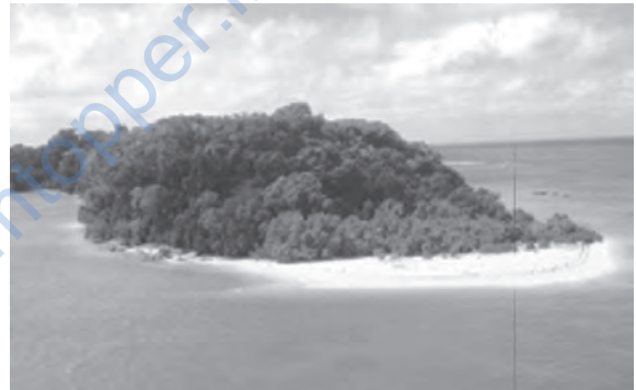
Figure 2.8 : An Island

The islands of the Arabian sea include Lakshadweep and Minicoy. These are scattered between 8° N-12° N and 71° E -74° E longitude. These islands are located at a distance of 280 km-480 km off the Kerala coast. The entire island group is built of coral deposits. There are approximately 36 islands of which 11 are inhabited. Minicoy is the largest island with an area of 453 sq. km. The entire group of islands is broadly divided by the Ten degree channel, north of which is the Amini Island and to the south of the Canannore Island. The Islands of this archipelago have storm beaches consisting of unconsolidated pebbles, shingles, cobbles and boulders on the eastern seaboard.