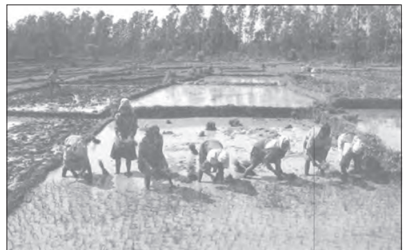
Figure 2.4 : Northern Plain

The south of Tarai is a belt consisting of old and new alluvial deposits known as the Bhangar and Khadar respectively. These plains have characteristic features of mature stage of fluvial erosional and depositional landforms such as sand bars, meanders, oxbow lakes and braided channels. The Brahmaputra plains are known for their riverine islands and sand bars. Most of these areas are subjected to periodic floods