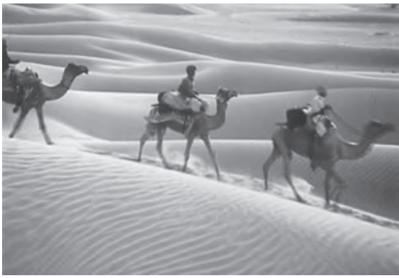
Figure 2.6 : The Indian Desert

Can you identify the type of sand dunes shown in this picture?