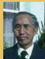
Angami Zapu Phizo

Assam accord brought peace and changed the face of politics in Assam, but it did not solve the problem of immigration. The issue of the 'outsiders' continues to be a live issue in the politics of Assam