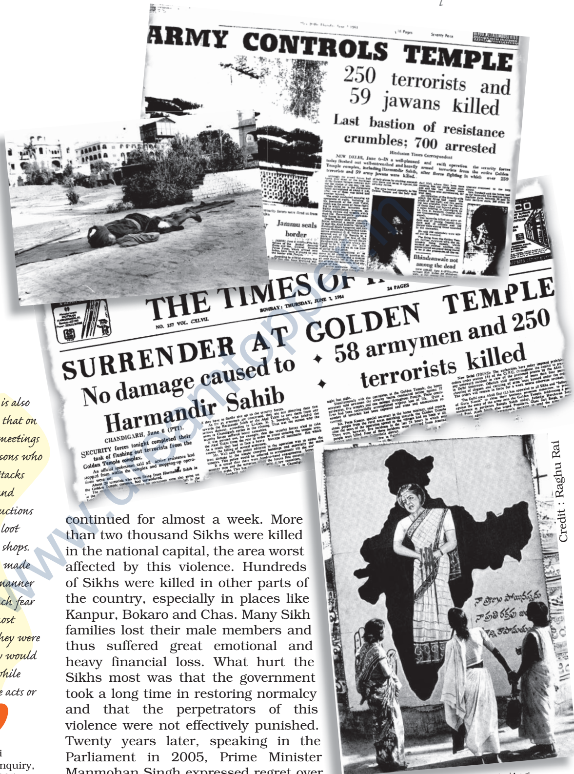
Women looking at a wall painting depicting Indira Gandhi's assassination.

continued for almost a week. More than two thousand Sikhs were killed in the national capital, the area most affected by this violence. Hundreds of Sikhs were killed in other parts of the country, especially in places like Kanpur, Bokaro and Chas. Many Sikh families lost their male members and thus suffered great emotional and heavy financial loss. What hurt the Sikhs most was that the government took a long time in restoring normalcy and that the perpetrators of this violence were not effectively punished. Twenty years later, speaking in the Parliament in 2005, Prime Minister Manmohan Singh expressed regret over these killings and apologised to the nation for the anti-Sikh violence.