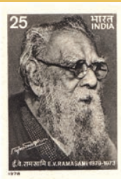
E.V. Ramasami Naicker (1879-1973):

Known as Periyar (the respected); strong supporter of atheism; famous for his anti-caste struggle and rediscovery of Dravidian identity; initially a worker of the Congress party; started the self-respect movement (1925); led the anti-Brahmin movement; worked for the Justice party and later founded Dravidar Kazhagam; opposed to Hindi and domination of north India; propounded the thesis that north Indians and Brahmins are Aryans.