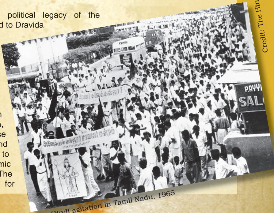
Anti-Hindi agitation in Tamil Nadu, 1965

The DK split and the political legacy of the movement was transferred to Dravida Munnetra Kazhagam (DMK). The DMK made its entry into politics with a three pronged agitation in 1953-54. First, it demanded the restoration of the original name of Kallakudi railway station which had been renamed Dalmiapuram, after an industrial house from the North. This demand brought out its opposition to the North Indian economic and cultural symbols. The second agitation was for