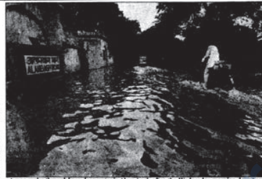
A man cycles through knee-deep water in Alam bagh after the Wednesday morning downpour in Lucknow—TOI photo.