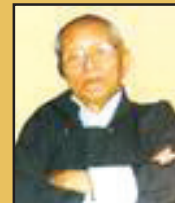
Kazi Lhendup Dorji Khangsarpa (1904): Leader of democracy movement in Sikkim; founder of Sikkim Praja Mandal and later leader of the Sikkim State Congress; in 1962 founded the Sikkim National Congress; after an electoral victory, he led the movement for integration of Sikkim with India; after the integration, Sikkim Congress merged with the Indian National Congress.

The first democratic elections to Sikkim assembly in 1974 were swept by Sikkim Congress which stood for greater integration with India. The assembly first sought the status of 'associate state' and then in April 1975 passed a resolution asking for full integration with India. This was followed by a hurriedly organised referendum that put a stamp of popular approval on the assembly's request. The Indian Parliament accepted this request immediately and Sikkim became the 22nd State of the Indian union. Chogyal did not accept this merger and his supporters accused the Government of India of foul play and use of force. Yet the merger enjoyed popular support and did not become a divisive issue in Sikkim's politics.