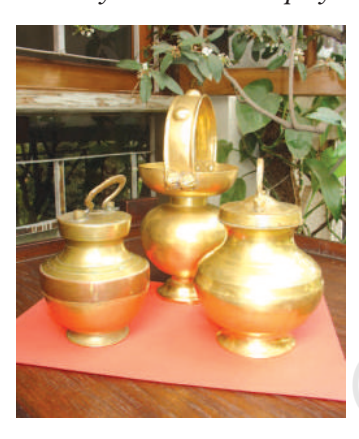
A variety of museum displays

If you are studying a particular craft in your theory or practical class, see if you can find historic examples of it in the local museum. Write a small essay of 200 words on the museum object. Study the object to understand the skills and techniques used in its manufacture. Do they differ from the skills and techniques used today? Have some of the skills and techniques disappeared?