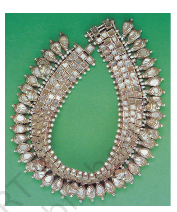
Hand-crafted jewellery in different metals