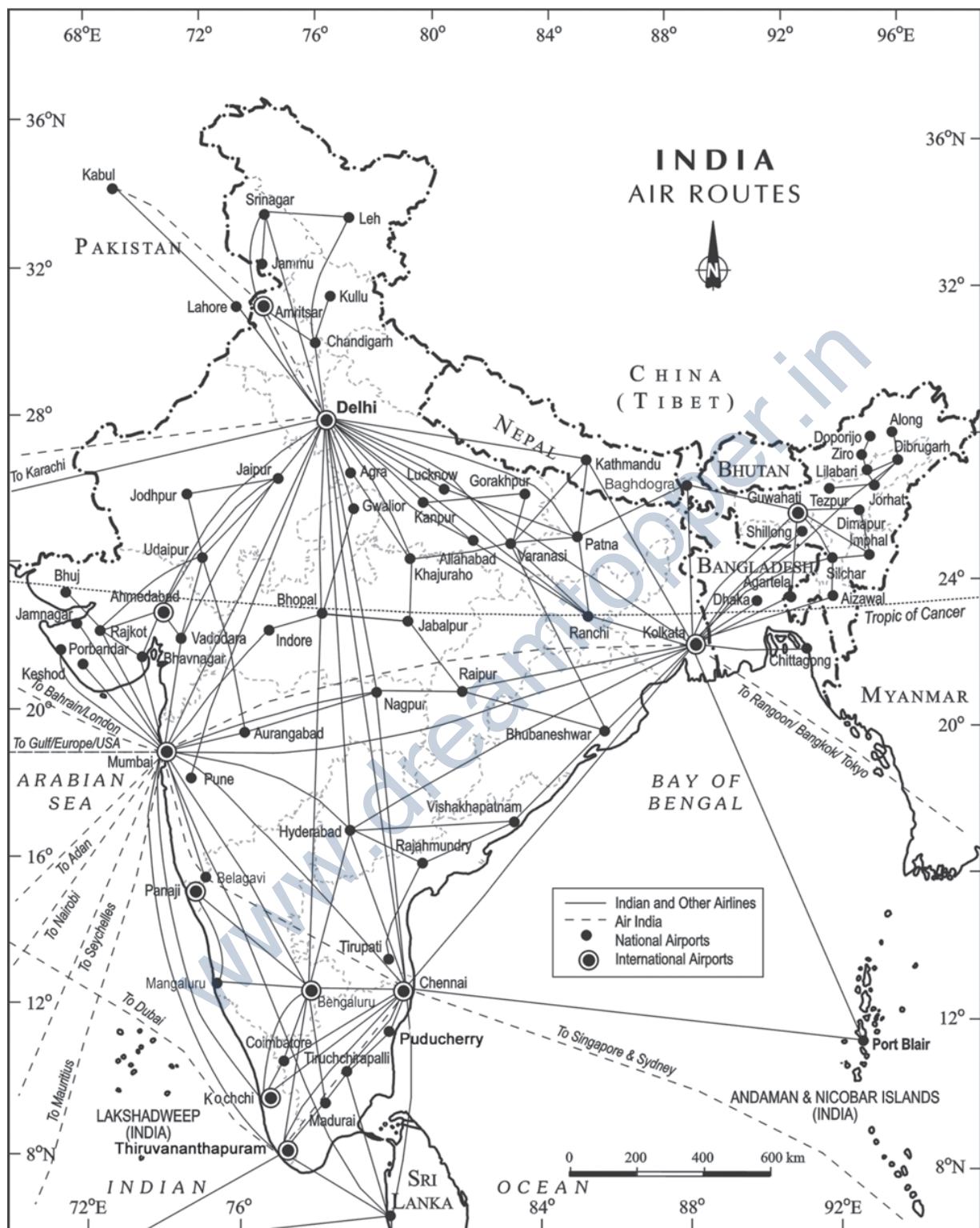
Fig. 11.5 : India – Air Routes