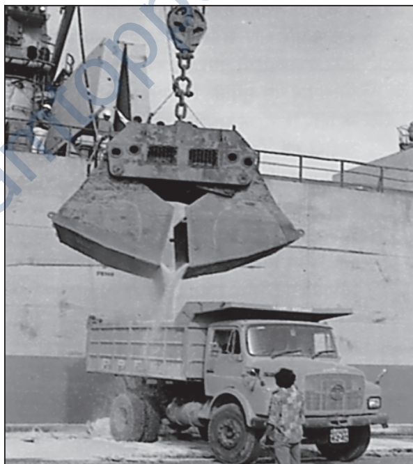
Fig. 11.3 : Unloading of goods on port

India is surrounded by sea from three sides and is bestowed with a long coastline. Water provides a smooth surface for very cheap transport provided there is no turbulence. India