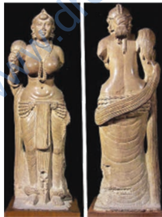
Yakshini, Mauryan Period, Bidargarh

The Indian National emblem of four lions seated in four directions, is representative of the highly polished monolithic lion-capital of Sarnath.