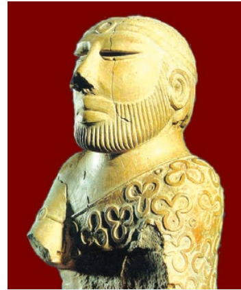
Bust of a bearded priest, Indus Valley Civilisation

Terracotta images were crude as compared to the stone and bronze statues. A large number of seals made of steatite, terracotta and copper of various shapes and sizes have also been discovered. Generally they are rectangular, some are circular and few are cylindrical. Almost invariably they bear on them the representation of a human or an animal figure and have on top an inscription in pictographic script which