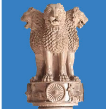
Lion Capital, Third Century B.C.E., Sanchi

under Mauryan control. Pillars, sculptures and rock-cut architecture, stūpas and vihāras , rock-cut caves and monumental figure sculptures were carved at several places belonging to this period. Ashoka got erected many monolithic pillars of sandstone, 30 to 40 feet high, crowned by animal figures like the bull, lion and elephant, inscribed with the ideas of morality, humanity and piety, which he wished his people to follow. Ashoka started making extensive use of stone for sculptures and great monuments whereas the previous tradition consisted of working with wood and clay. Famous Ashokan pillars are from Lauriya Nandangarh in Bihar, Sanchi and Sarnath. Excellent specimens of the Mauryan craftsmanship in fashioning the human figure are provided by the colossal statues of Yakṣa and Yakṣī , found from Patna, Vidisha and Mathura.