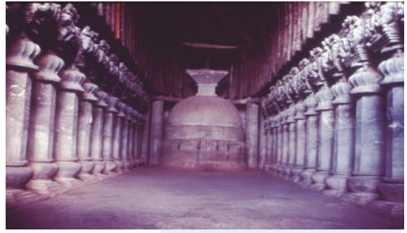
Chaitya Hall, Karla caves, Kanheri

Located in Aurangabad District of Maharashtra, Ajanta has twenty-nine caves, built over a period of almost eight centuries. We have already read about the paintings of Ajanta caves in this chapter. Cave number 26 is very big and the entire interior hall is carved with a variety of Buddha images, the biggest one being the Mahāparinibbāṇa image. The rest of the caves are vihāra-caitya caves. They consist of a pillared veranda, a pillared hall and cells along the walls.