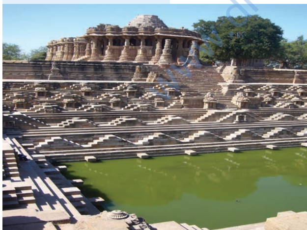
Sun temple, Modhera, Gujarat

The temples in the north-western parts of India including Gujarat and Rajasthan, and stylistically extendable, at times, to western Madhya Pradesh are too many to include here in a comprehensive way. The stone used to build the temples ranges in colour and type. While sandstone is the commonest, a grey to black basalt can be seen in some of the tenth to twelfth century temple sculptures. The most exuberant and