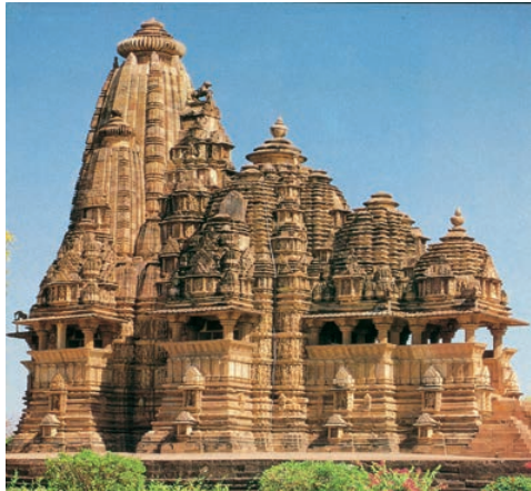
Vishvanatha temple, Khajuraho