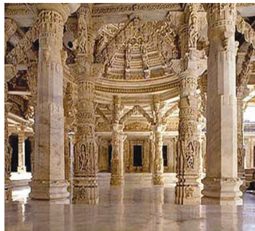
Jain temple, Eleventh – Thirteenth Century, Rajasthan