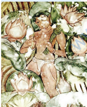
Mural Painting, Ninth Century C.E., Sittanavasal