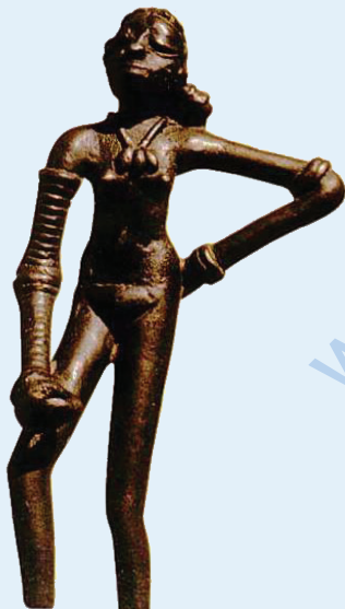
Dancing Girl, Indus Valley Civilisation

You have already read about the Indus Valley Civilisation in earlier classes which is one of the earliest civilisations existed during the second half of the third millennium B.C.E. In present days, there are sites of this civilisation having an expanse in Harappa and Mohenjodaro in Pakistan and in India, Lothal and Dholavira in Gujarat, Rakhigarhi in Haryana, Ropar in Punjab, Kalibangan and Balathal in Rajasthan. This civilisation has the unique example of well laid out town planning, artefacts such as sculptures in various materials, seals, pottery, jewellery, terracotta figures, etc. The use of metal casting techniques prevalent in those days is not very different from the contemporary practices. One of the earliest examples of civic planning with houses, markets, storage facilities, offices, public baths, burial ground, etc., were arranged in a grid-like pattern. There was also a highly developed drainage system.