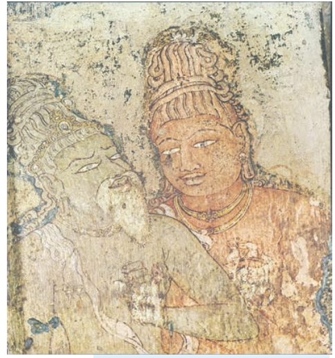
Mural Painting, Eleventh Century C.E., Thanjavur

Even today, we observe that mural paintings on interior and exterior walls of houses in villages or havelis are prevalent in different parts of the country. These paintings are usually made by women either at the time of ceremonies or festivals or as a routine to clean and decorate the wall and the floor. Some of the traditional forms of murals are Pithoro in parts of Madhya Pradesh, Rajasthan and Gujarat, Mithila painting in northern Bihar's Mithila region, Warli paintings in Maharashtra, or simply paintings on the walls, be it in a village of Odisha or Bengal, Madhya Pradesh or Chhattisgarh.