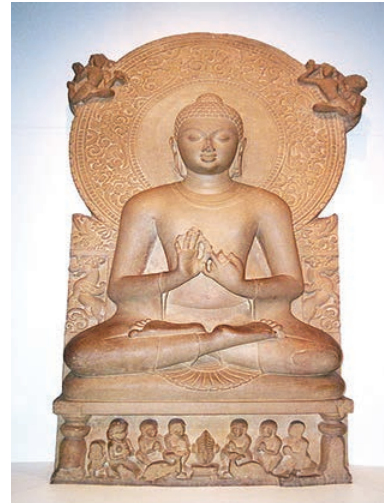
Seated Buddha, Sarnath

by the local artist craftsmen working in the local tradition. At Mathura, it clearly emerges from the Yaksha tradition.