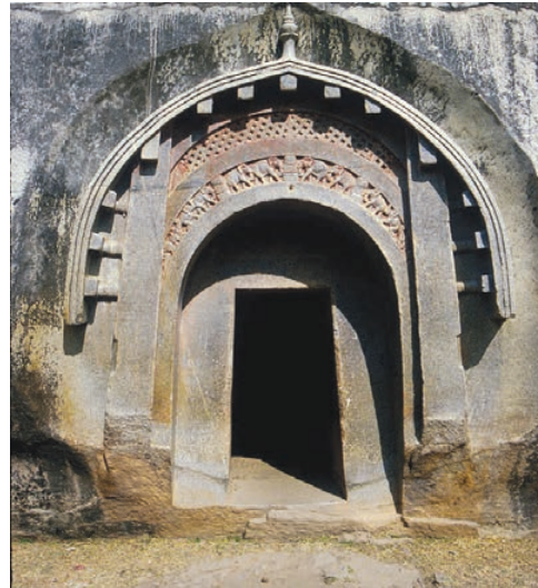
Lomas Rishi cave

Mathura, Gandhara and Sarnath schools are predominantly Buddhist. Images of Buddha in Gandhara and Mathura was a parallel development, where it was produced