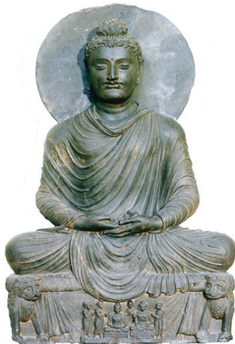
Meditating Buddha, Third–fourth century C.E., Gandhar