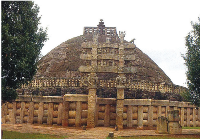
Sānchi Stūpa, Second Century B.C.E., Sanchi

has not been deciphered so far. A seated figure surrounded by four animals—a rhino, a buffalo, an elephant and a tiger is unique.