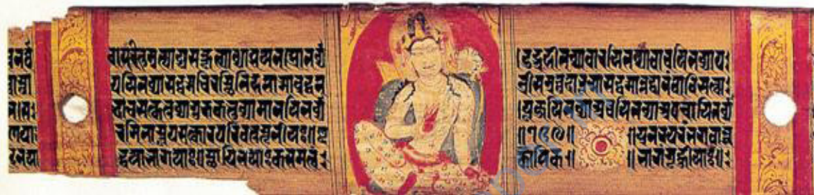
Palm leaf Manuscript Painting

The Buddhist manuscript paintings of Pala period, earliest being the Aṣṭā Sāhasrikā Prajñāpāramitā , were drawn in red and white, forming colour planes. The inspiration came from the metal images, giving an illusion of relief. Miniatures were painted according to the rules of mural painting, the rule of proportions being regulated by strict codes of measurement. Effects such as foreshortening were derived from the study of sculpture rather than from reality. The human figure was represented in the simplest and most visible manner. Against a background of rich colour, stood out thick, boldly drawn figures. The paintings were harmonised with the enclosing script. The Jain painters from western India preferred three-quarter profiles, displacing one of the eyes to avoid foreshortening, while frontal images had eyes set near the bridge of the nose.