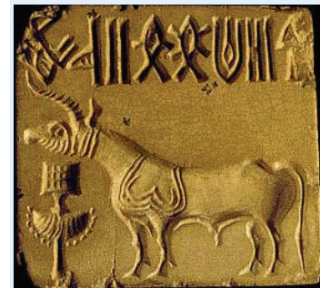
Seal Unicorn, Indus Valley site