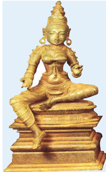
Chola Bronze, Tamil Nadu

Interesting images of Jain Tirthankaras have been discovered from Chausa, Bihar, belonging to the Kushana Period during second century C.E. These bronzes show how the Indian sculptors had mastered the