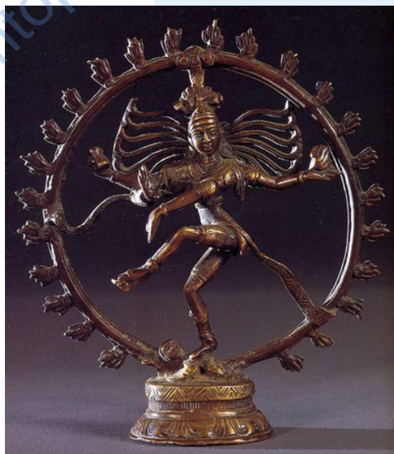
Nāṭarāja, Chola period