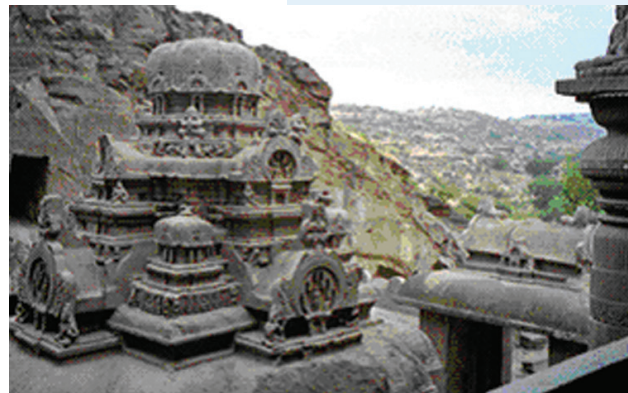
Kailashanath Temple, Eleventh Century C.E., Ellora