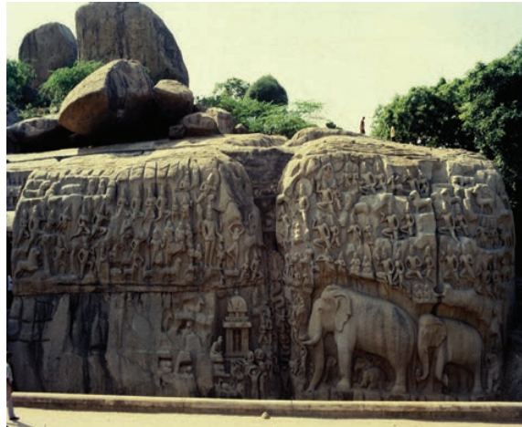
Ratha style of temples, Mahabalipuram

shrine at the rear. The Brahmanical cave numbers 13–28 have many sculptures. Many caves are dedicated to Shaivism, but the images of both Shiva and Vishnu and their various forms according to Puranic narrative are depicted. The sculptures at Ellora are monumental, and have protruding volume that create deep recession in the picture space. The images are heavy and show considerable sophistication in the handling of sculptural volume. Various guilds at Ellora came from different places like Vidarbha, Karnataka and Tamil Nadu and carved the sculptures. Thereby it is the most diverse site in India in terms of the sculptural styles. One of the early examples of Ratha style of temples is at Mahabalipuram where the five Rathas represent the five Pandavas.