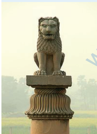
Lion Capital, Mauryan Period, Rampurva