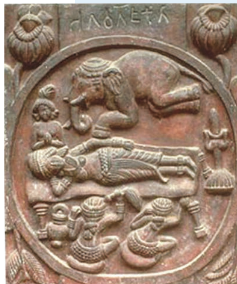
Queen Maya's dream, Bharhut