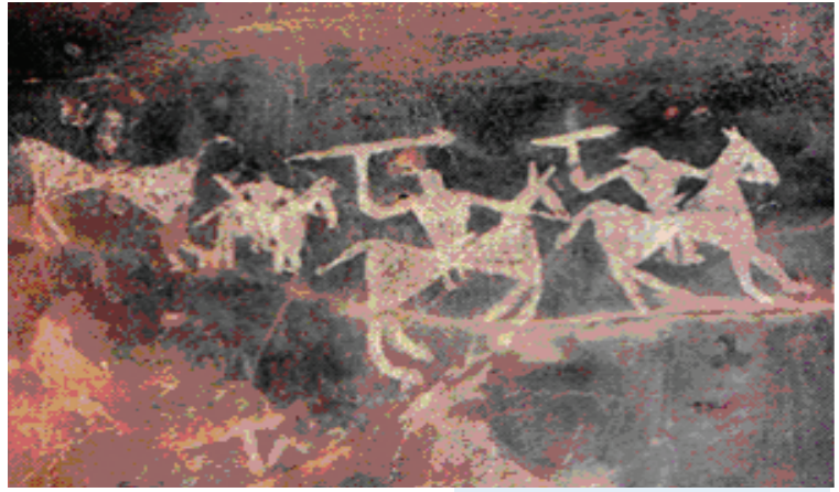
Hunting Scene, Prehistoric Painting, Bhimbetka

A large number of sites, where remnants of rock paintings in the Indian sub-continent have been found on the walls of the caves situated in Madhya Pradesh, Uttar Pradesh, Andhra Pradesh, Karnataka, Uttarakhand and Bihar. The richest paintings are almost 10,000 years old as reported from the Vindhya ranges of Madhya Pradesh and their Kaimurean extensions into Uttar Pradesh. These hill ranges are full of Paleolithic and Mesolithic remains of paintings depicting human and animal figures and geometric patterns in white, black and red ochre. Humans are represented in stick figures. Wavy lines, rectangle-filled geometric designs, and groups of dots can also be seen. One of the interesting scenes commonly depicted is of hand-linked dancing human figures. It is interesting to note that at many rock-art sites, often a new painting is painted on the top of an older painting. At Bhimbetka, in some places, there are as many as 20 layers of paintings, one on top of another.