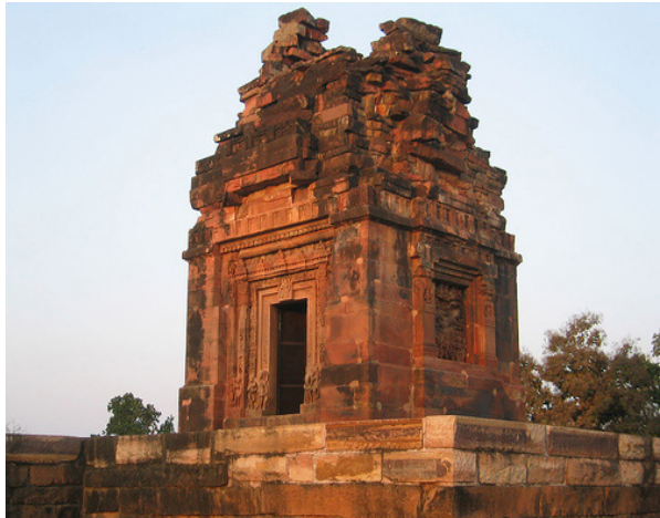
Daśāvātara Vishnu temple, Fifth century C.E., Deogarh