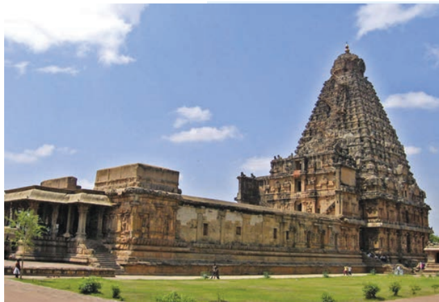
Jain temple, Eleventh – Thirteenth Century, Rajasthan

The main architectural features of Odisha temples are classified in three orders, i.e., rekhāpīḍa , pidhadeula and khākarā . Most of the main temple sites are located in ancient Kalinga—modern Puri District, including Bhubaneswar or ancient Tribhuvaneshvara, Puri and Konark.