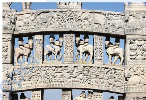
Gate (Details), Fifth century C.E., Sanchi