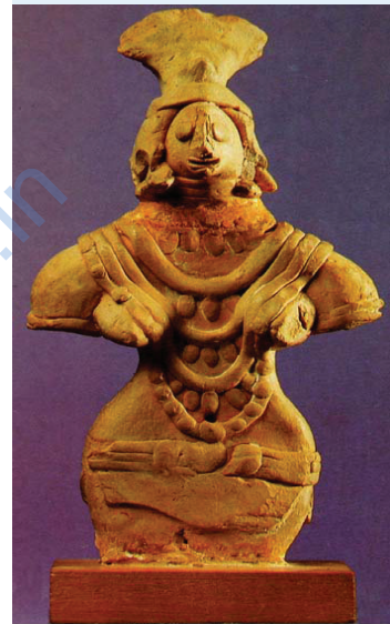
Terracotta Indus Valley site