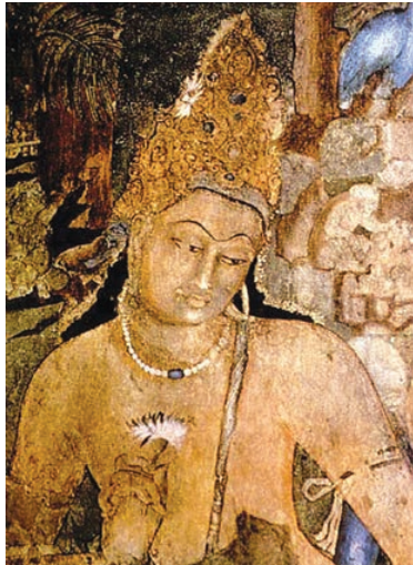
Mural Paintings, Fifth–Sixth Century C.E., Ajanta caves

The tradition of painting extended further down South in Tamil Nadu in the preceding centuries with regional variations during the regimes of Pallava, Pandya and Chola dynasties, not only in caves but on the walls of temples and palaces too.