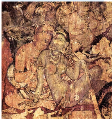
Mural Paintings, Fifth–Sixth Century C.E., Ajanta caves