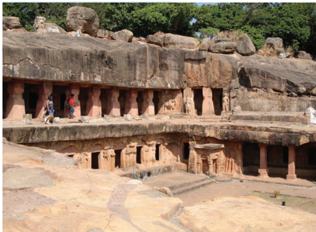
Udayagiri and Khandagiri caves near Bhubaneswar

The back wall has the main Buddha shrine. Shrine images at Ajanta are grand in size.