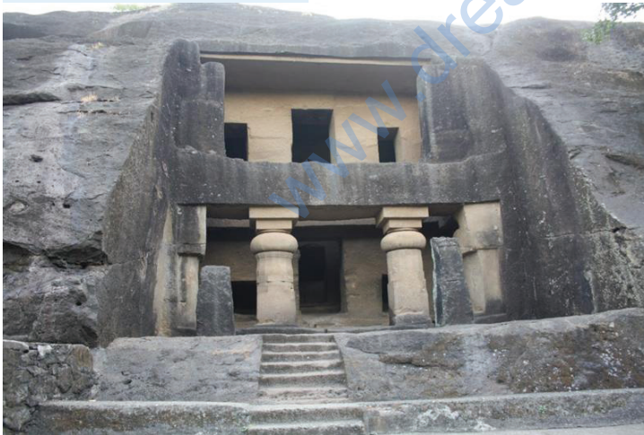
Unfinished Chaitya cave, Kanheri

In the Pallava Period, bronzes of the eighth century is the icon of Shiva seated in ardhaparyāṅka āsana (one leg kept dangling). The right hand is in the ācamana