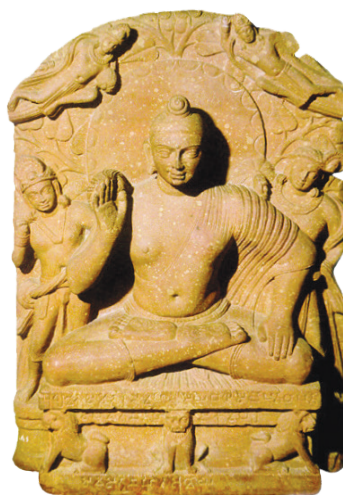
Seated Buddha, Katra Mound, Mathura