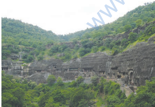
Chaitya Hall, Karla cave, Kanheri