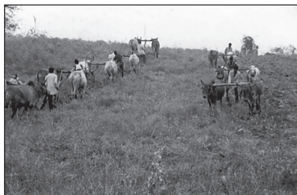
Fig. 12.5 : Community Participation for Land Leveling in Common Property Resources in Jhabua (ASA, 2004)