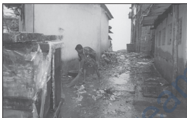
Fig. 12.3 : A view of urban waste in Mahim, Mumbai