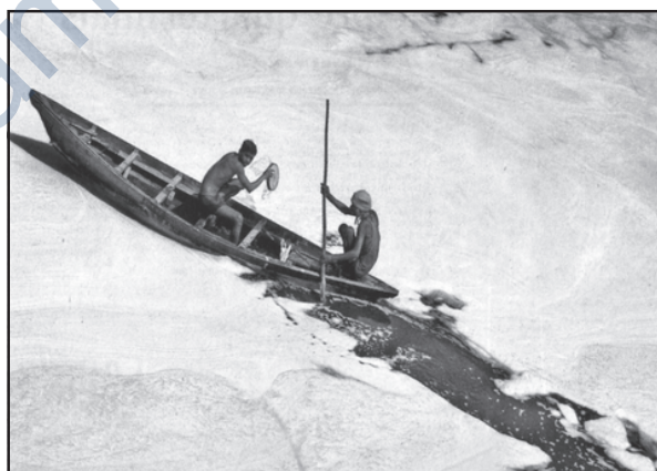
Fig.12.1 : Cutting Through Effluent : Rowing through a pervasive layer of foam on the heavily polluted Yamuna on the outskirts of New Delhi

Indiscriminate use of water by increasing population and industrial expansion has led degradation of the quality of water considerably. Surface water available from rivers, canals, lakes, etc. is never pure. It contains small quantities of suspended particles, organic and inorganic substances. When concentration of these substances increases, the water becomes polluted, and hence becomes unfit for use. In such a situation, the self-purifying capacity of water is unable to purify the water.