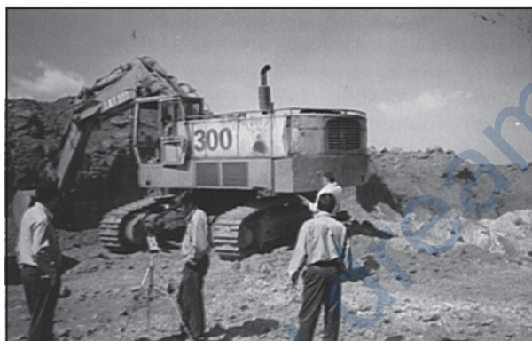
Fig. 12.2 : Noise monitoring at Panchpatmalai Bauxite Mine

The main sources of noise pollution are various factories, mechanised construction and demolition works, automobiles and aircraft, etc. There may be added periodical but polluting noise from sirens, loudspeakers used in various festivals, programmes