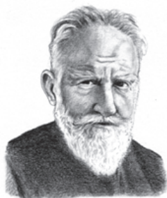
G.B. Shaw 1856-1950

George Bernard Shaw was a dramatist and critic. His work as a London newspaper critic of music and drama resulted in The Quintessence of Ibsenism. His famous plays include Arms and the Man, Candida and Man and Superman. His works present a fearless intellectual criticism, sugar-coated by a pretended lightness of tone. He rebelled against muddled thinking, and sought to puncture hollow pretensions.