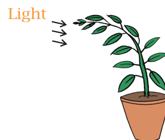
Fig. 25.2 A potted plant showing phototropism