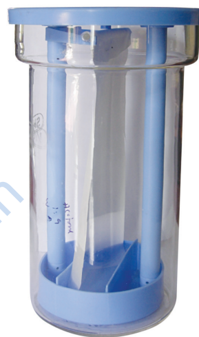
Fig. 23.2 Experimental setup of the chromatography