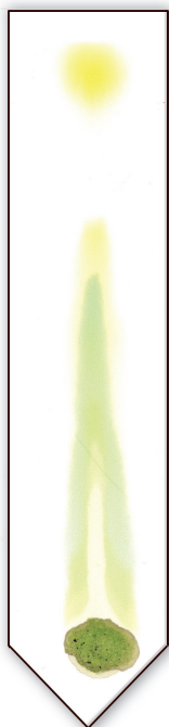
Fig. 23.3 A chromatogram of chlorophyll