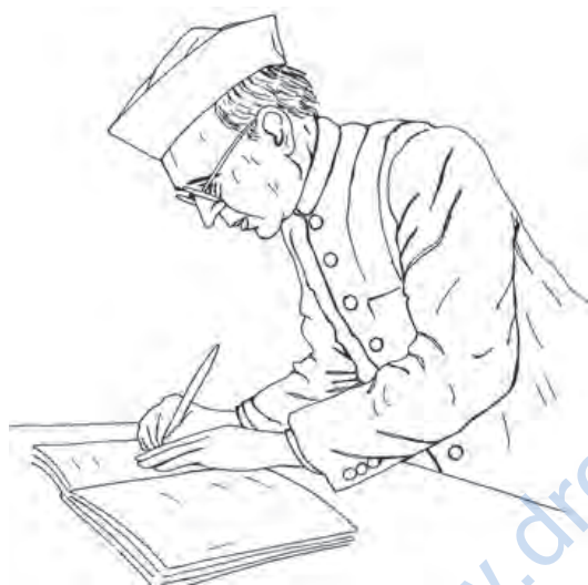
Jawaharlal Nehru CAD, Vol. VI, p. 734

We have already seen that President is the formal head of the government. In this formal sense, the President has wide ranging executive, legislative, judicial and emergency powers. In a parliamentary system, these powers are in reality used by the President only on the advice of the Council of Ministers. The Prime Minister and the Council of Ministers have support of the majority in the Lok Sabha and they are the real executive. In most of the cases, the President has to follow the advice of the Council of Ministers.