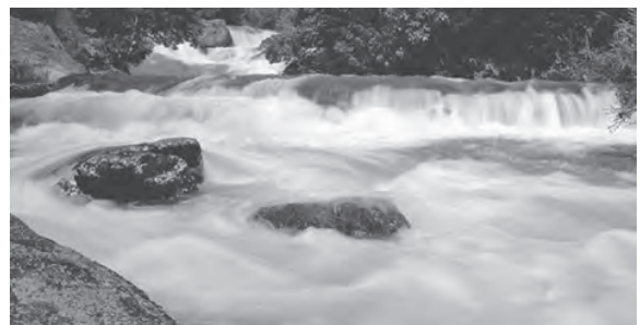
Figure 3.3 : Rapids

The Himalayan drainage system has evolved through a long geological history. It mainly includes the Ganga, the Indus and the Brahmaputra river basins. Since these are fed both by melting of snow and precipitation, rivers of this system are perennial. These rivers pass through the giant gorges carved out by the erosional activity carried on simultaneously with the uplift of the Himalayas. Besides deep gorges, these rivers also form V-shaped valleys, rapids and waterfalls in their mountainous