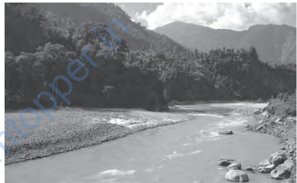
Figure 3.1 : A River in the Mountainous Region

2006) in this class . Can you, then, explain the reason for water flowing from one direction to the other? Why do the rivers originating from the Himalayas in the northern India and the Western Ghat in the southern India flow towards the east and discharge their waters in the Bay of Bengal?