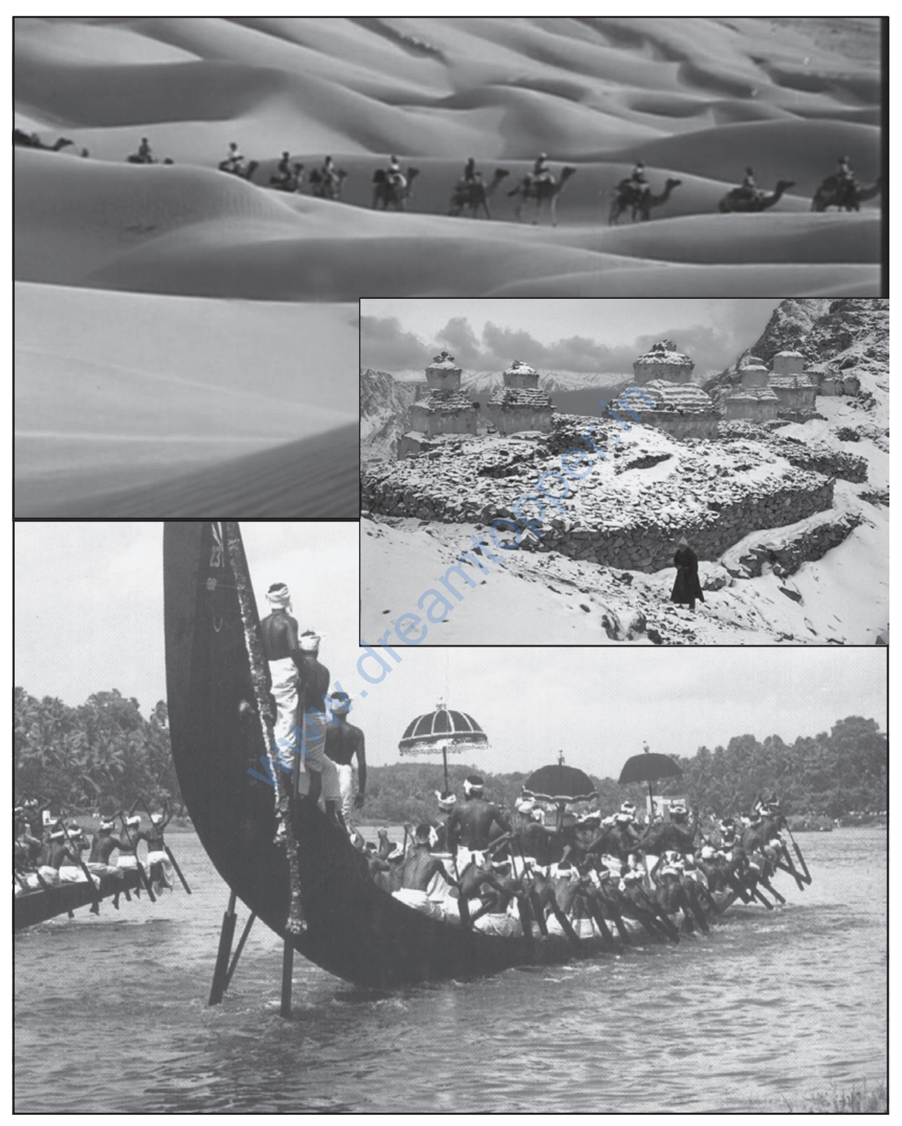
Discuss how natural settings affect culture