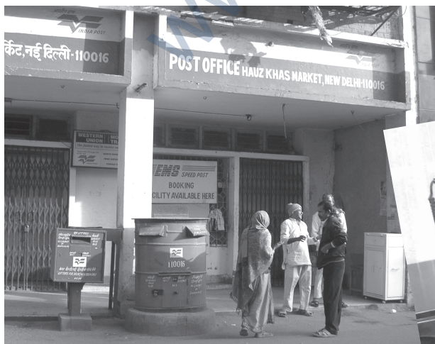
New technologies and organisations that speeded up various forms of communication

New technologies speeded up various forms of communication. The printing press, telegraph, and later the microphone, movement of people and goods through steamship and railways helped quick movement of new ideas. Within India, social reformers from Punjab and Bengal exchanged ideas with reformers from Madras and Maharashtra. Keshav Chandra Sen of Bengal visited Madras in 1864. Pandita Ramabai travelled to different corners of the country. Some of them went to other countries. Christian missionaries reached remote corners of present day Nagaland, Mizoram and Meghalaya.