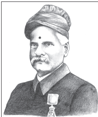
Raja Ravi Varma

Apart from ways of life and thinking the west influenced Indian art and literature. Artists like Ravi Varma, Abanindranath Tagore, Chandu Menon and Bankimchandra Chattopadhyaya were all grappling with the colonial encounter. The box below captures the many ways that style, technique and the very theme of an artist like Ravi Varma were shaped by western and indigeneous traditions. It discusses the portrait of a family in a matrilineal community of Kerala but one that significantly resembles the very typical patrilineal nuclear family of the modern west consisting of the father, mother and children.