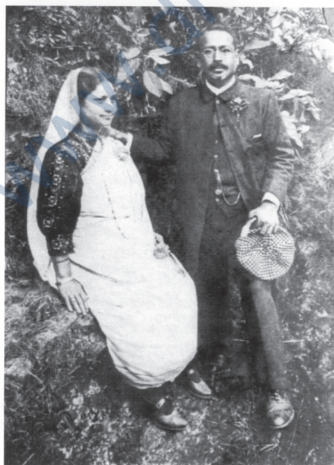
The mix and match of the traditional and modern

of cloth was differently worn in different regions. The standard way that the modern middle class woman wears it was a novel combination of the traditional sari with the western 'petticoat' and 'blouse'.