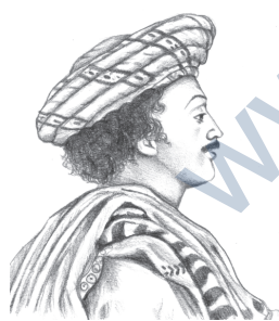
Raja Ram Mohun Roy