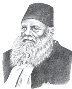
Sir Syed Ahmed Khan

You have already seen the far-reaching impact of colonialism on our lives. The social reform movements which emerged in India in the 19 th century arose to the challenges that colonial Indian society faced. You probably are familiar with what were termed social evils that plagued Indian society. The well-known issues are that of sati ,