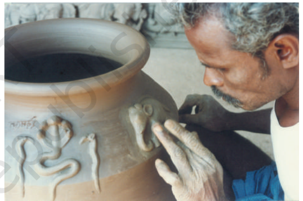
Traditional potter (above) and weaver (below) at work

In The Arts of India by G.C.M. Birdwood, he cites the nineteenth chapter of the second section ('Ayodhyakanda') of the Ramayana , to list the inhabitants of the city that are represented in the procession with Bharata to seek Rama. They are the trade guilds of artisans: the jewellers, potters, ivory-workers, perfumers, goldsmiths, weavers, carpenters, braziers, painters, musical instrument makers, armourers, curriers, blacksmiths, coppersmiths, makers of figures, cutters of crystals, glassmakers, inlayers and others. In present-day India we can formulate broad groupings of major practitioners of craft as potters, weavers, metal-smiths, wood-carvers, cane and bamboo weavers and stone carvers. While these may be the larger skills, there are many other crafts from shola pith work, papier-mâché , innumerable styles of mural, miniature and floor painting, paper crafts, glass work, and carpet and duree weaving. In the area of textiles India undoubtedly has the largest range of skills that can be found anywhere in the world. While separating the craft of making floor coverings out of rags and yarn, we are left with textiles that consist of