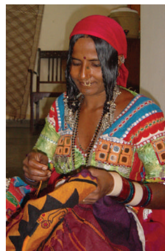
A Kutchi woman embroidering

The various tribes inhabiting the north-east of India live among the rich bamboo forests where the finest quality of skill in the weaving of bamboo, cane and other wild grasses can be seen. This group links itself culturally to the people