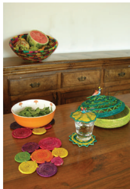
Baskets, mats, coasters designed for everyday use

There are many issues and areas of work involved in this story: child labour, women's work, the skill of basket making, designing new baskets, finding new uses for these baskets, calculating the cost of each basket so that they fetch a fair return without making the basket too expensive, planning a marketing strategy including an exhibition, a catalogue, web marketing, learning about the benefits of a self-help group and the availability of micro credit.