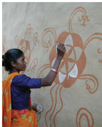
Wall and floor decoration in a house, Jharkhand