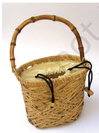
Bamboo basket, Vietnam

The textiles of the tribals of central India have their own distinct identity. The tribes of central India spin and weave thick cream coloured yarn with madder red borders and end pieces reflecting images from their lives. Birds, flowers, trees, deer or even an airplane decorate these cloths. In Orissa, ceremonial cloths to be worn by the priest or priestess are required to be of a certain colour. Each colour has an auspicious meaning and unity of communities is expressed through the similarity of dress and adornment.