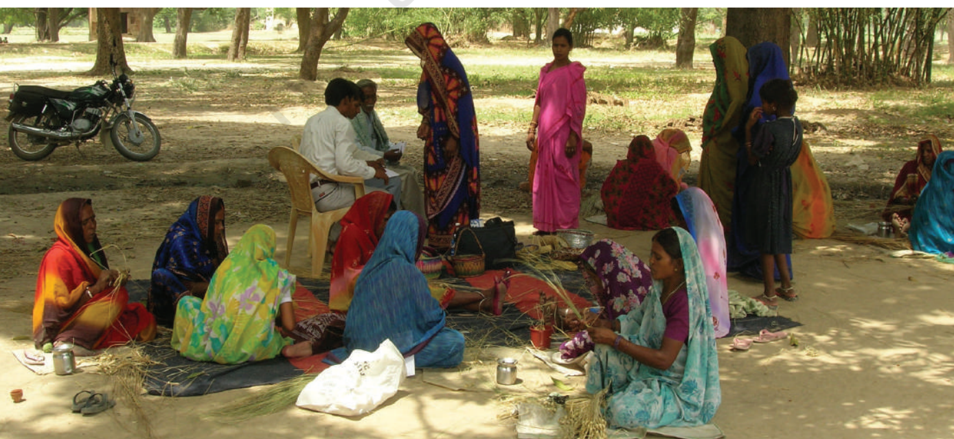
Women weaving baskets with local moonj grass, Bhadohi, Uttar Pradesh

In Bhadohi District of Uttar Pradesh hundreds of women took up carpet weaving since young boys went to school after the anti-child-labour campaign came into effect. Sometimes four or five women weave a carpet together under uncomfortable conditions, earning a meagre Rs 1500 per carpet collectively. For women-headed households the burden of bringing up children and staying alive under such conditions can hardly be imagined. During a visit to some carpet producing villages it was found that these women, as a part of tradition and custom, weave baskets with local moonj grass to serve as containers for sweets, saris, jewellery, fruit and other items on ceremonial family occasions. The brightly dyed grass of moonj is woven into small and large baskets with intricate designs depending on the creativity and mood of the maker. With some minor suggestions regarding colour, size and costing, the women were encouraged to bring a collection of these baskets from every home and sell them at Dilli Haat in New Delhi. What began as a shy and hesitant venture ended in delight as the women sold out their stock earning Rs 17,000 in the process. They described their experience as one of independence, for they had control of the raw material (free grass from the fields), control over production (home- and leisure-based work), control over creativity (they design each