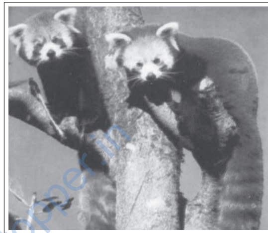
Figure 14.2 : Red Panda — an endangered species

It includes those species which are in danger of extinction. The IUCN publishes information about endangered species world-wide as the Red List of threatened species.