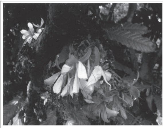
Figure 14.3 : Humboldtia decurrens Bedd — highly rare endemic tree of Southern Western Ghats (India)

There is an urgent need to educate people to adopt environment-friendly practices and reorient their activities in such a way that our development is harmonious with other life forms and is sustainable. There is an increasing consciousness of the fact that such conservation with sustainable use is possible only with the involvement and cooperation of local communities and individuals. For this, the development of institutional structures at local levels is necessary. The critical problem is not merely the conservation of species nor the habitat but the continuation of process of conservation.