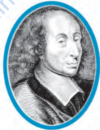
Blaise Pascal (1623-1662)

In earlier classes, we have learnt how to find the squares and cubes of binomials like a + b and a - b . Using them, we could evaluate the numerical values of numbers like (98)^2 = (100 - 2)^2 , (999)^3 = (1000 - 1)^3 , etc. However, for higher powers like (98)^5 , (101)^6 , etc., the calculations become difficult by using repeated multiplication. This difficulty was overcome by a theorem known as binomial theorem. It gives an easier way to expand (a + b)^n , where n is an integer or a rational number. In this Chapter, we study binomial theorem for positive integral indices only.