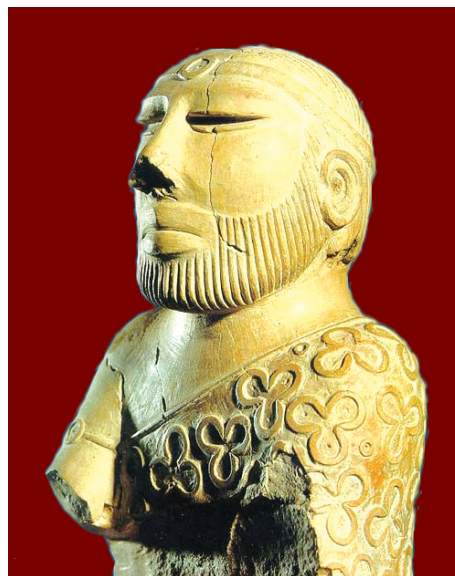
Bust of a bearded priest

The figure of the bearded man, interpreted as a priest, is draped in a shawl coming under the right arm and covering the left shoulder. This shawl is decorated with trefoil patterns. The eyes are a little elongated, and half-closed as in meditative concentration. The nose is well formed and of medium