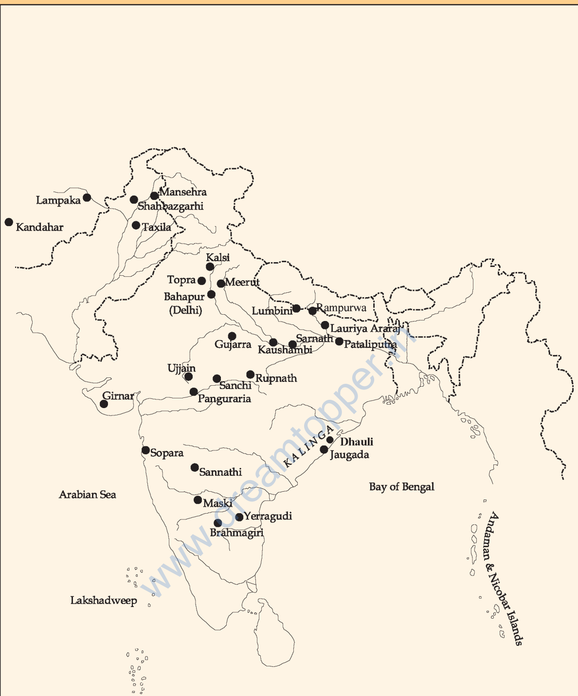
Map showing Mauryan sites (Outline map not to scale)