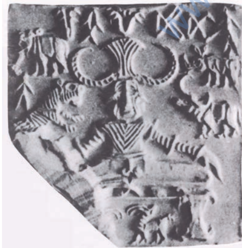
Pashupati seal/female deity

goat and also monsters. Sometimes trees or human figures were also depicted. The most remarkable seal is the one depicted with a figure in the centre and animals around. This seal is generally identified as the Pashupati Seal by some scholars whereas some identify it as the female deity. This seal depicts a human figure seated cross-legged. An elephant and a tiger are depicted to the right side of the seated figure, while on the left a rhinoceros and a buffalo are seen. In addition to these animals two antelopes are shown below the seat. Seals such as these date from between 2500 and 1900 BCE and were found in considerable numbers in sites such as the ancient city of Mohenjodaro in the Indus Valley. Figures and animals are carved in intaglio on their surfaces.