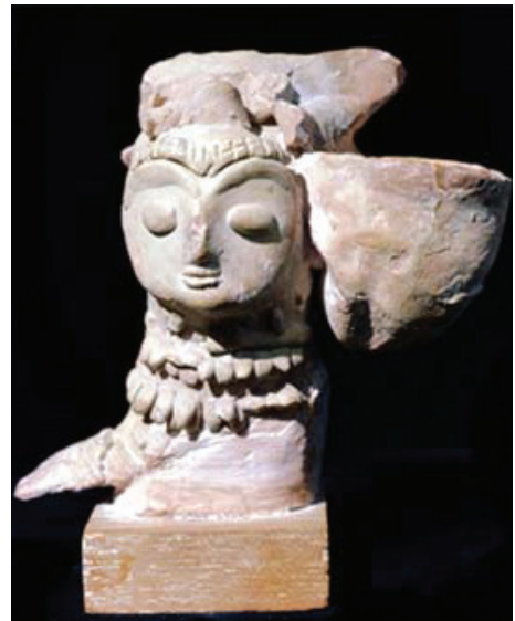
A terracotta figurine