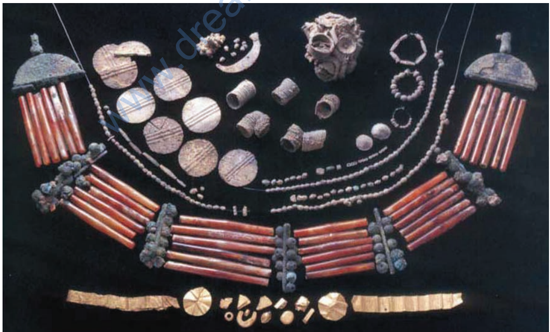
Beadwork and jewellery items

It is evident from the discovery of a large number of spindles and spindle whorls in the houses of the Indus