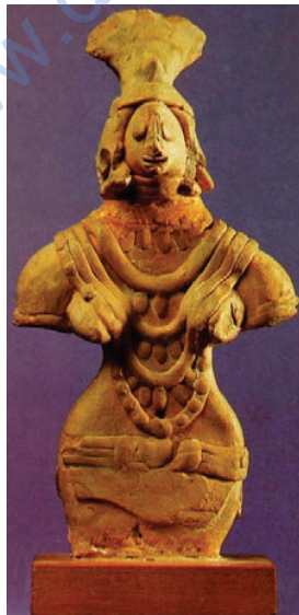
Mother goddess, terracotta

The art of bronze-casting was practised on a wide scale by the Harappans. Their bronze statues were made using the 'lost wax' technique in which the wax figures were first covered with a coating of clay and allowed to dry. Then the wax was heated and the molten wax was drained out through a tiny hole made in the clay cover. The hollow mould thus created was filled with molten metal which took the original shape of the object. Once the metal cooled, the clay cover was completely removed. In bronze we find human as well as animal figures, the best example of the former being the statue of a girl popularly titled 'Dancing Girl'. Amongst animal figures in bronze the buffalo with its uplifted head, back and sweeping horns and the goat are of artistic merit. Bronze casting was popular at all the major centres of the Indus Valley Civilisation. The copper dog and bird of Lothal and the bronze figure of a bull from Kalibangan are in no way inferior to the human figures of copper and bronze from Harappa and Mohenjodaro. Metal-casting appears to be a continuous tradition. The late Harappan and Chalcolithic sites like Daimabad in Maharashtra yielded excellent examples of metal-cast